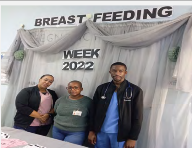
DOCTORS AT THE GYNAECOLOGY OUTPATIENTS DEPARTMENT (GOPD)