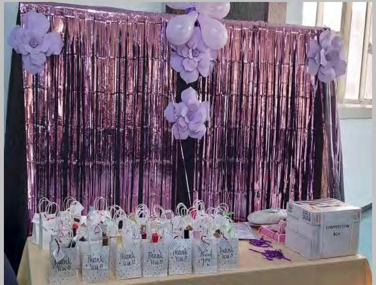
GIFT BAGS FOR THE WOMEN IN LEADERSHIP