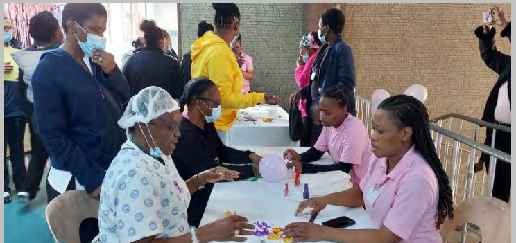
Manicure stall manned by social work interns

The ladies being treated to pampering sessions.