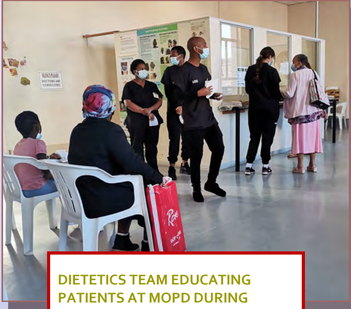
DIETETICS TEAM EDUCATING PATIENTS AT MOPD DURING HYPERTENSION WEEK 2022.