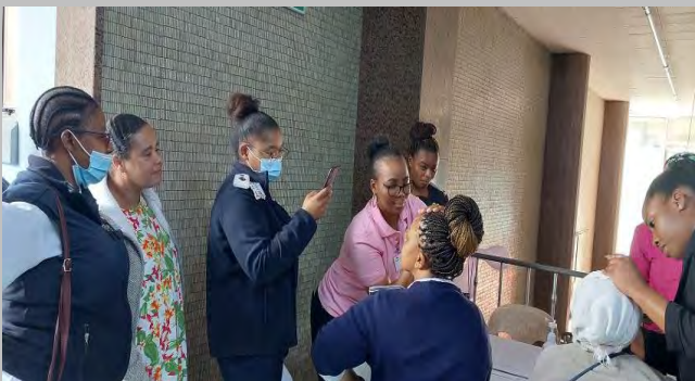
Make up stall , staff waiting patiently for their turn.

The day was filled with laughter and good cheer