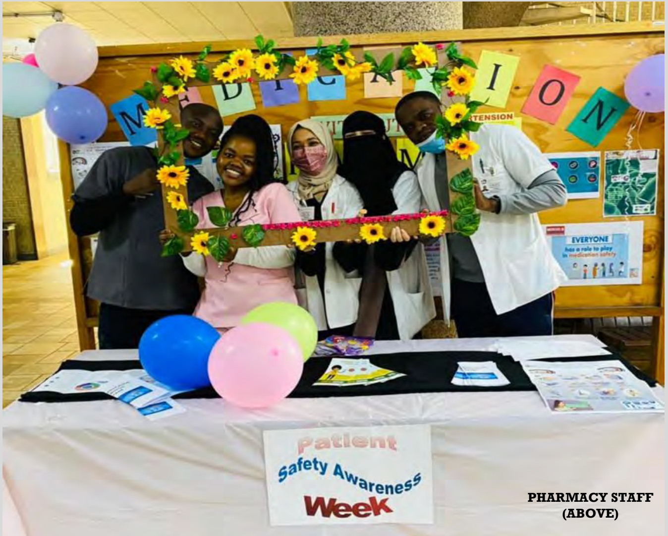
PHARMACY STAFF (ABOVE)

P atient Safety Awareness Week is an annual event intended to encourage everyone to learn more about health care safety. This year the theme was : “ Medication Without Harm ”.