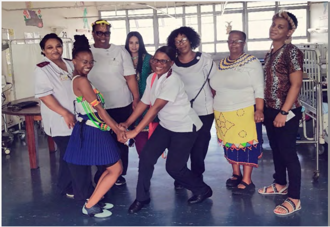
Ward 13 A celebrating heritage day in style.