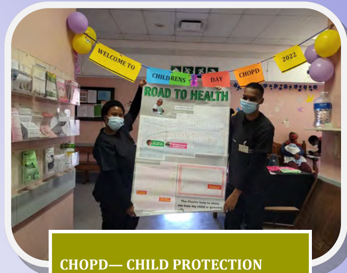
CHOPD— CHILD PROTECTION WEEK ON THE 1ST OF JUNE 2022

Child protection week took place from the 29 th May – 5 th June 2022. It is about the safeguarding of children from violence, exploitation, abuse and neglect. Article 19 in the UN Convention on the Rights of the Child provides for the protection of children in and out of the home. One of the ways to ensure this is by giving them quality education so that they can develop and thrive. It was also the ideal opportunity to raise awareness about Children's Rights in South Africa.