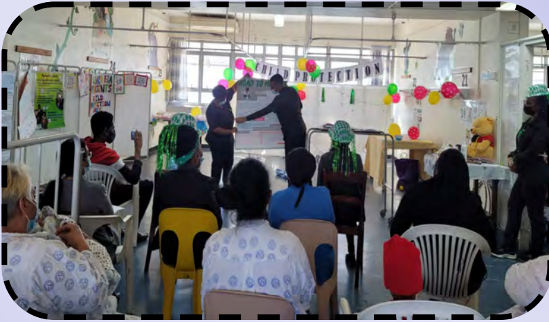
Ward 13 A