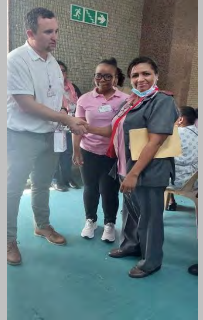
Dr Green handing over the Gift Bags to the lovely ladies

The day was filled with laughter and good cheer