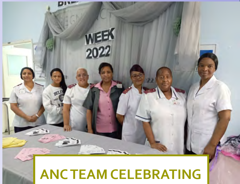
ANC TEAM CELEBRATING BREASTFEEDING WEEK