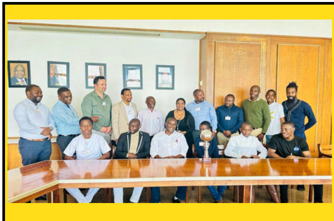
Addington soccer team presenting the cup to management