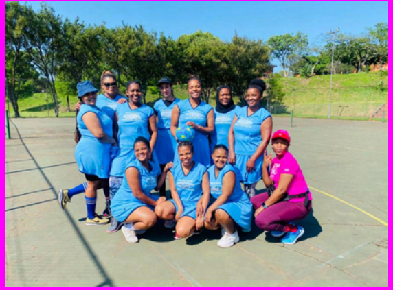
Netball team representing Addington