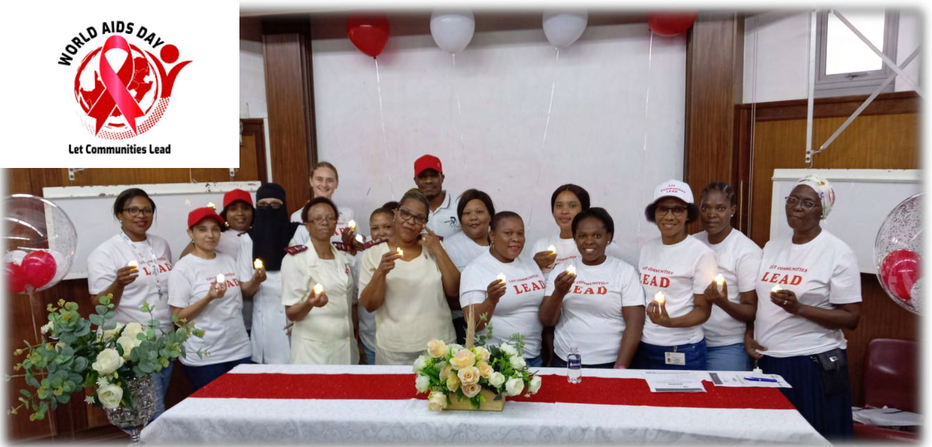
(Above - Addington Hospital HAST unit and Nursing management )

On the 3rd December 2023, Addington Hospital marked World AIDS Day with an impactful event hosted by the HIV & AIDS / STI / TB (HAST) unit. The occasion brought together patients, staff members, stakeholders, and community representatives to reflect on the critical importance of raising awareness about HIV/AIDS and supporting those affected by the disease.