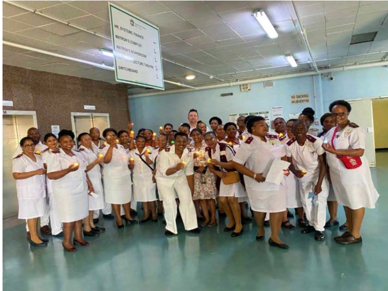
(Above) Addington Hospital nursing staff commemorate international nurses day.