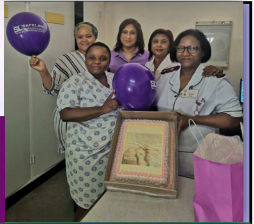
Paediatric staff with a mother of a premature baby