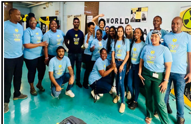
World Radiography day celebrated on the 8th of November 2023.