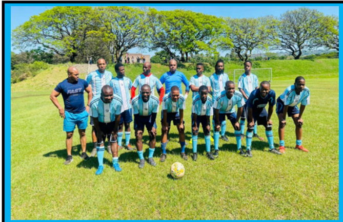
Addington soccer team at the sport tournament