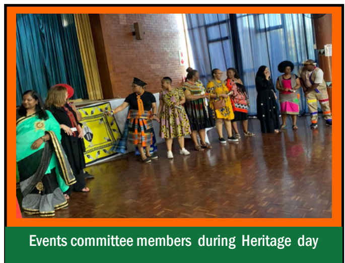
Events committee members during Heritage day