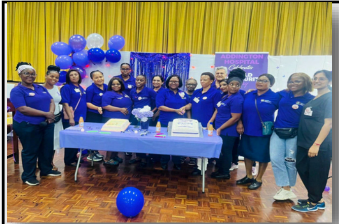
Prematurity day organised by ADH paediatrics unit