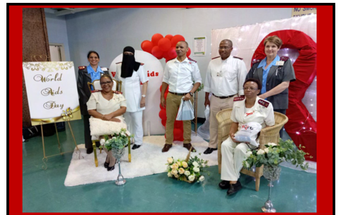
Nursing management during World Aids Day