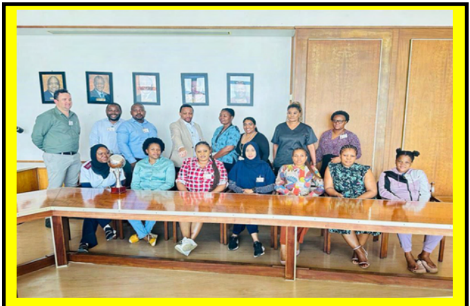
Addington netball team with ADH management