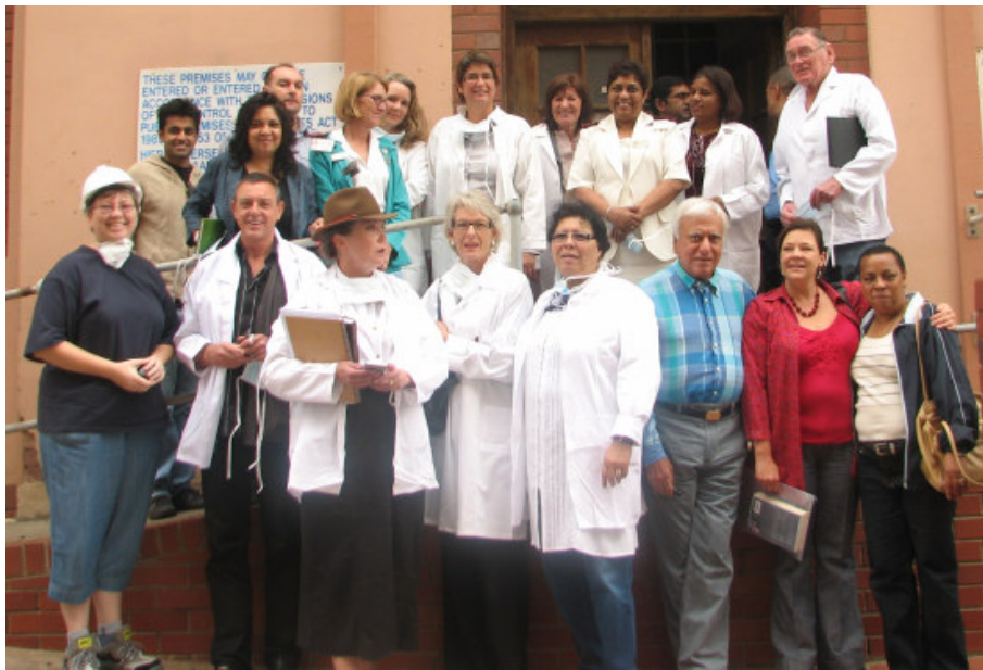
The Walk-about Group!! 27 November 2009