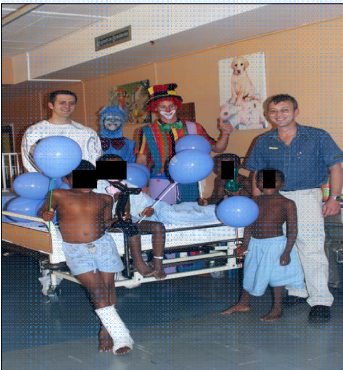
The giving team with children in Ward 13A