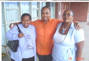
Three of the excited students posing for a picture

Ayikho into ehlula ukubekezela—there is nothing that conquers perseverance These are the words they mentioned as they pose for the picture outside Paddington Hall