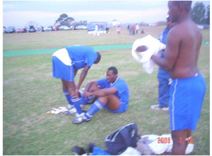
That was the end of the road for Addies Boys when they were beaten on the semi final by Department of Agriculture .