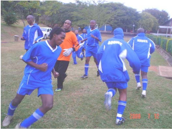
The Addies Boys were warming up preparing their next game against Edendale Hospital, where they won by 2-0.