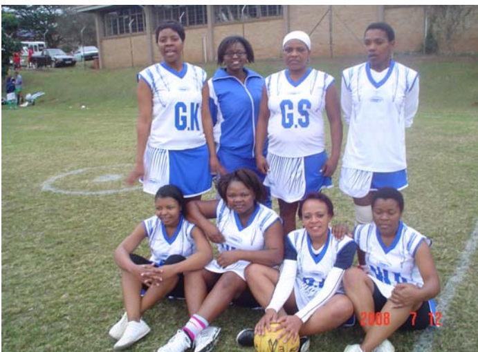
This is Addies Netball team who was beaten on the Finals by Edendale Hospital on the tournament that was held on the 12th of July 2008 at Grey's Sports Grounds. These are the players who made us proud on that day: