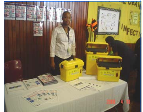
These are some highlights of stalls that were displayed during Health Awareness Day held at Addington hospital on the 10th of April 2008. Showcasing their beautiful stalls, from left: Oncology Dept, Bio-oil, and Compass waste.