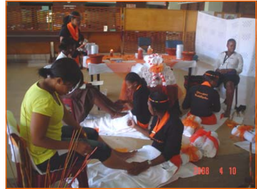
Mangwanani Beauty Spa advertising their Health services during Health Awareness Day at Addington Hospital .

Addington hospital held a health Awareness day on the 10th of April 2008, the purpose of the event was to raise awareness on health issues amongst staff members as they spend their time looking after patients but we tend to neglect ourselves. Staff members were advised on the latest treatments and services provided by alternative providers. The target audiences were all categories of staff members, their families and friends. During the event the hospital displayed a lot of activities from various categories - internal and external participants, where most stands offered information on health; nutritional habits; the need for regular exercise; counseling; and service for drugs/ alcohol abusers etc. The power point presentation on stress management, Employee Awareness Programme and other beneficial programmes were presented to the audiences .