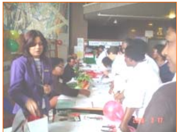
The staff visited different stalls to learn more about Human Right.