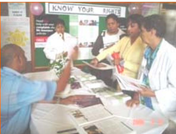
Patients and staff given booklets about Human Rights on our stalls during Human Rights Day.

The employees were given a full explanation on Grievance Procedures to express their dissatisfaction regarding any official act or omission by the employer, which adversely affect them in the employment relationship . During the progress of the event it has been highlighted that although it is encouraged that a grievance must as fast as possible be resolved by an employee closest to the point of origin , sometimes the involvement of a “third party “( in this case Staff Relations) is often effective. Information on the rules and grievance procedure were explained up to the Conciliation and Arbitration stage. All prescripts on Disciplinary Procedure were communicated to the audience.