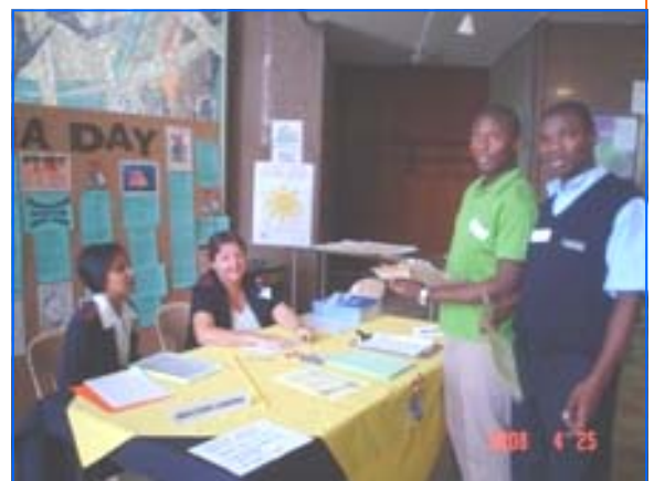
Clients and hospital staff visited their stall inside the hospital foyer.