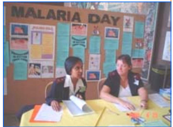
The infection Control Team conducting an awareness during Malaria Day .