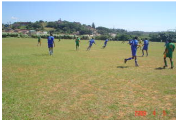
Addington Hospital in action against Wentworth Hospital, Addington was beaten 1-0

Addington Hospital Soccer Team is still maintaining their good performance for years this comes after the matches that they have played, on 14 March 2009 in Verulam Sports Grounds where they have lied on a second position following Prince Mshiyeni Hospital.