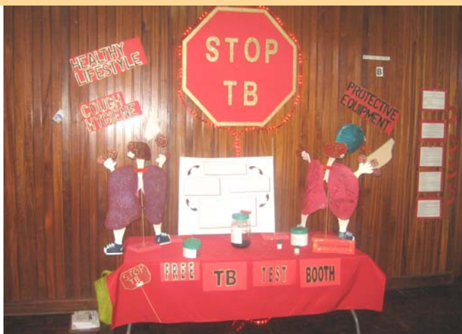
Information on T.B. was also made available