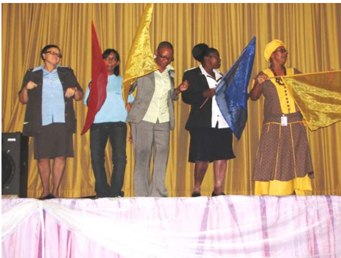
Staff members were full of joy as reflected in the dancing