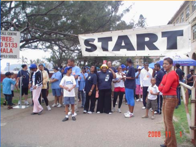
The staff members preparing themselves for the start of the Fun Walk