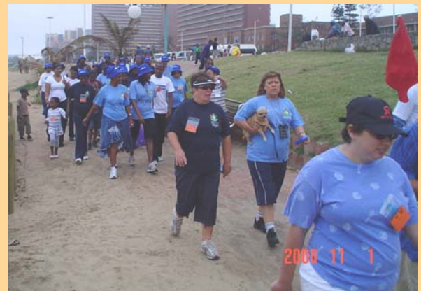
Staff members having fun—walking along the Beach during the 5km Fun Walk