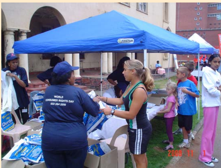
Preparations started early in the morning prior to the commencement of the Fun Walk