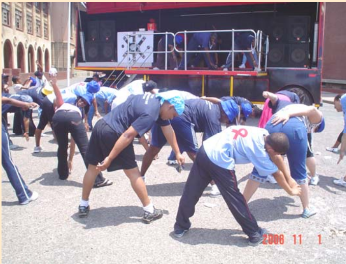
Staff members doing some exercises during the Hospital Fun Walk