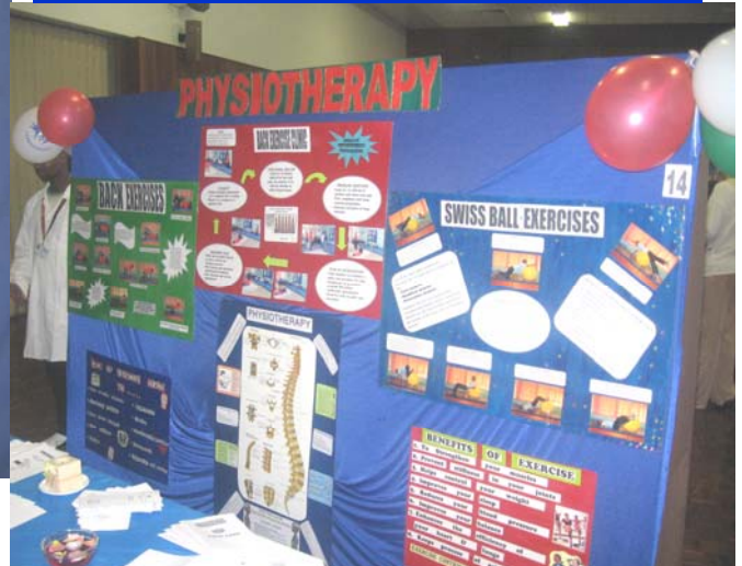
Physiotherapy Department achieved 1st position for their model