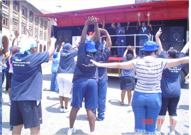
After the Fun Walk staff had a chance to do some training