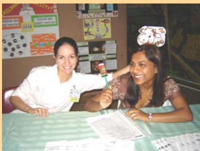
Dietetics Department staff having fun after the event—which was a great success.