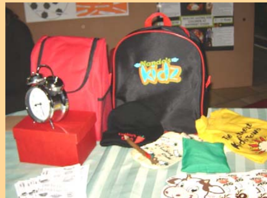
Some of the stalls that were displayed during the Hospital Nutritional Week