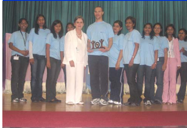
Team Physiotherapy Department who came 1st for both Model and Oral Presentations