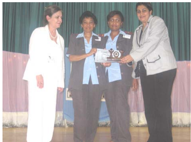
Maternity Ward - 3rd Place for Poster Presentation