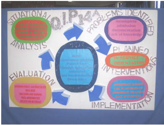
Ward 14A Stall showing the QIP cycle