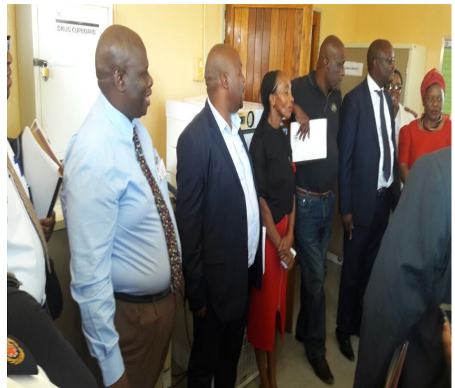
Zululand Health District Manager amongst the members of the Legislature sharing information about the Njoko clinic