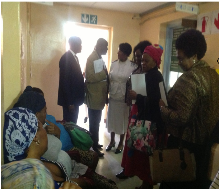
Queen T.J Zulu—hospital board vice chairperson doing walkabout the hospital with the members of the legislature, pregnant mothers delighted and having conversation with the members of the Legislature