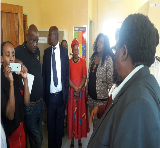
Members of the Legislature arrived at Njoko clinic to check on progress made since their last visit in 2014