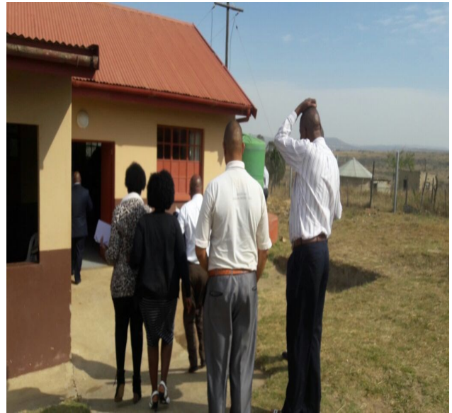
Zululand District team arriving at Njoko clinic