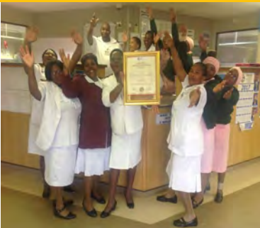
Peadiatric Achievement Celebrations. Read more on pg 2