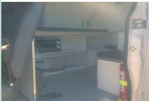
Inside the mobile vehicle , there is fridge, microwave . The vehicle is fully equipped