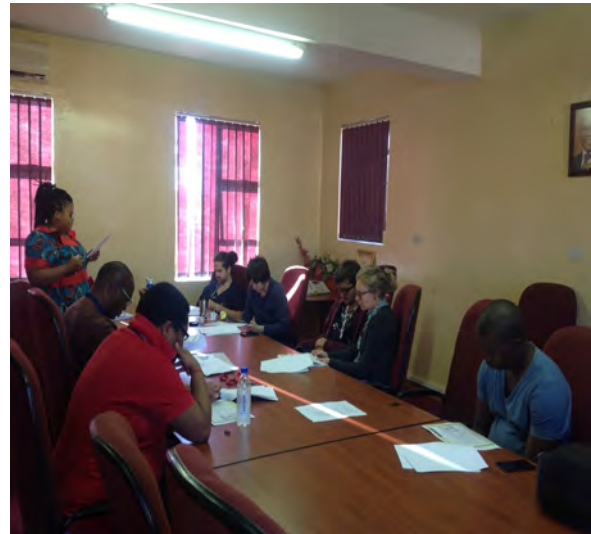
Mrs Zulu PRO , Conducting Batho– Pele training, customer care in-service training to Hospital Doctors , so as to improve quality of service to our clients

On the 7/07/2017 the PRO conducted Batho-pele training to Doctors and Hospital staff.