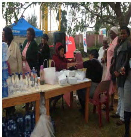
GEMS instructor conducting aerobics to staff