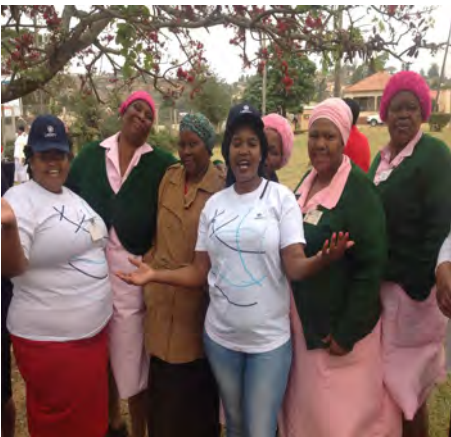
EAP, the organizer , standing with the PRO and hospital staff