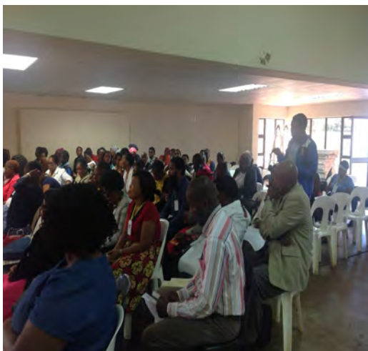
It was Question time for the committee members