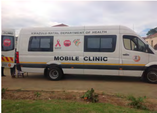
Benedictine Hospital has received 2 mobile vehicles to improve primary health care services