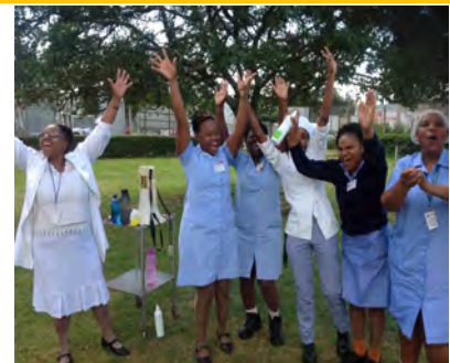
Hand Wash Relay Read more on pg 8