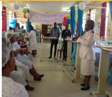
BreastFeeding Week , Read more on pg 3