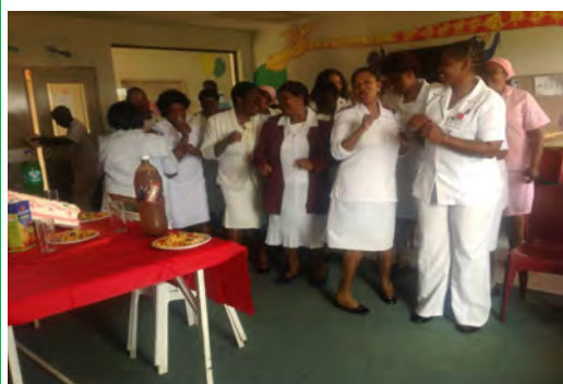
Peadiatric ward choir singing, welcoming the certificate