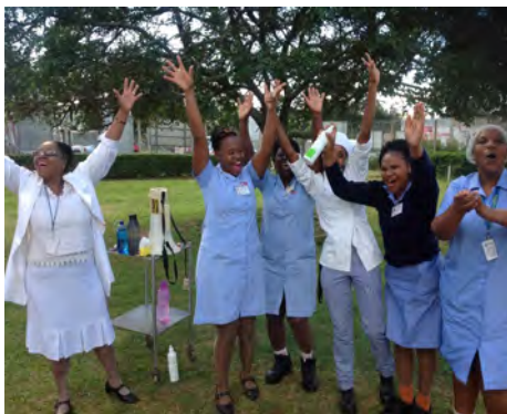
IPC and Kitchen staff after washing their hands and finishing the relay