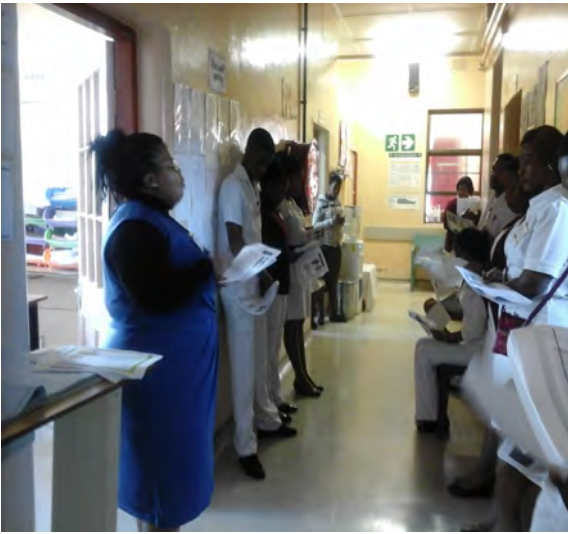
PRO conducting Batho –Pele , and customer care In-service training to Maternity staff