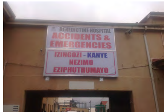
Quality Improvement—new emergency light box installed at the hospital emergency area.