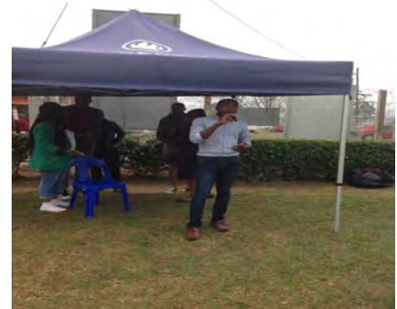
Dietician motivating employees on proper diet

Screening services, were offered to employees , and health education