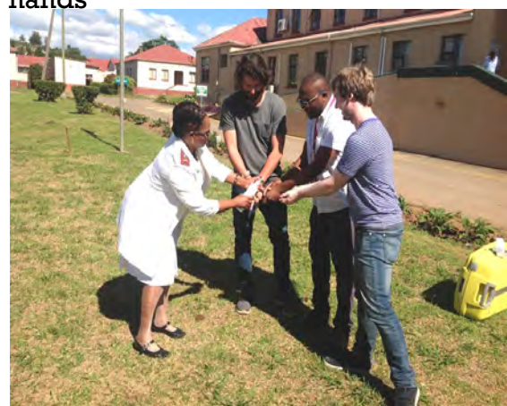
IPC Manager spraying Doctors hands and emphasizing on importance of washing hands .