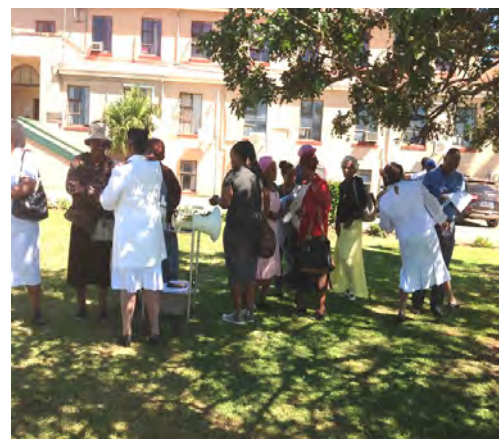
Hospital clients also were part of the hand wash relay , IPC spraying their hands