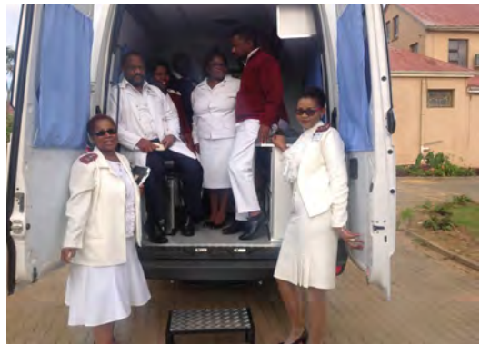
PHC Manager , PHC Supervisors, and Mobile clinic staff excited on their New mobile vehicle