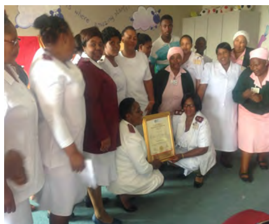
Staff at peads posing with the certificate

Benedictine hospital peadiatric ward was assessed in March 2017 by Head office, and the ward got overall score of 76%.