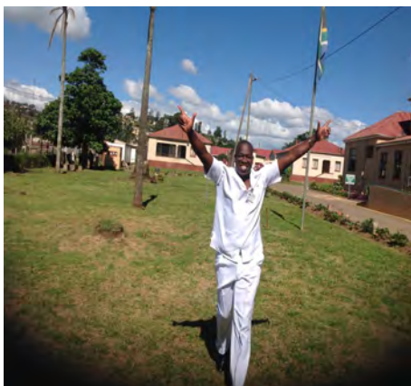
Operational Manger surgical ward celebrate after washing his hands and finishing the