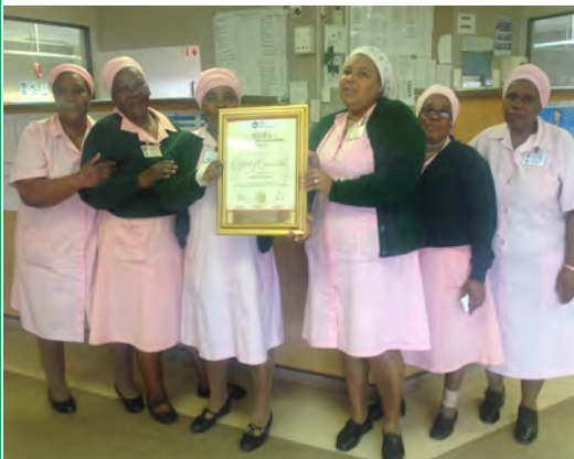
Excitement as the General orderlies at peads ward celebrate their achievement