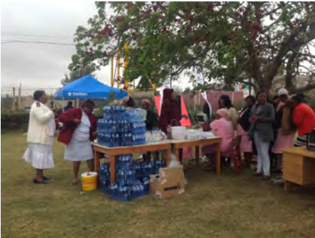
Acting Ceo ,opening the event

Aerobics were also conducted by the personal trainer from GEMS .