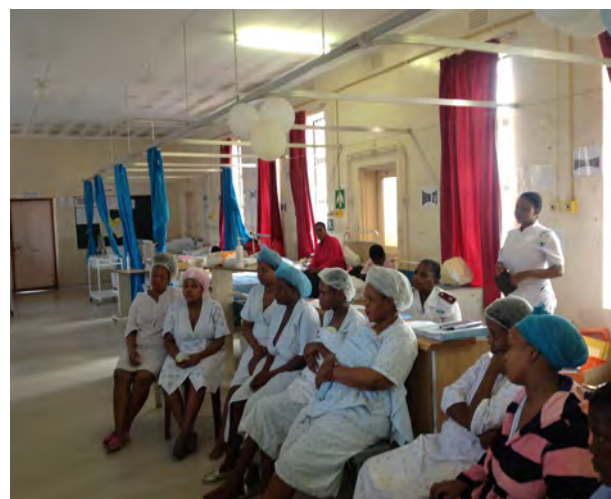
Mothers listening attentively to the talks by the Dietetics team on the importance of breastfeeding