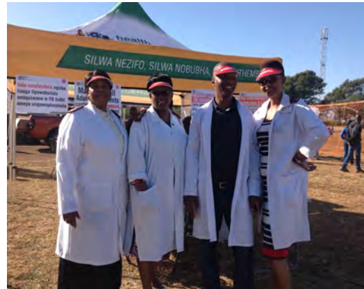
Benedictine Hospital management ready to provide health screening to the clients

On the 22/07/2017 Benedictine hospital and Nongoma Built IT hosted a soccer tournament under 13 years teams.