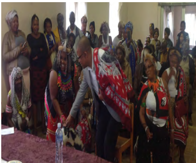
CEO receiving his present from traditional health practitioners

ilities. This launch was specifically aimed at reviving the local structure and creating rapport between the hospital and traditional healers and improving the lives of Nongoma population. The launch was a success with various guest from all over Nongoma. All attendees were happy to see such initiative being done. It was a celebratory event filled with song and dance capped off with exchange of gifts.