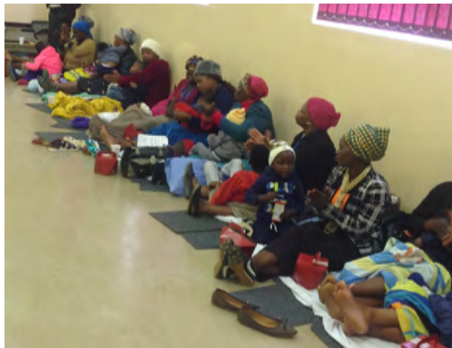
Christmas party for cerebral palsy kids on page 01