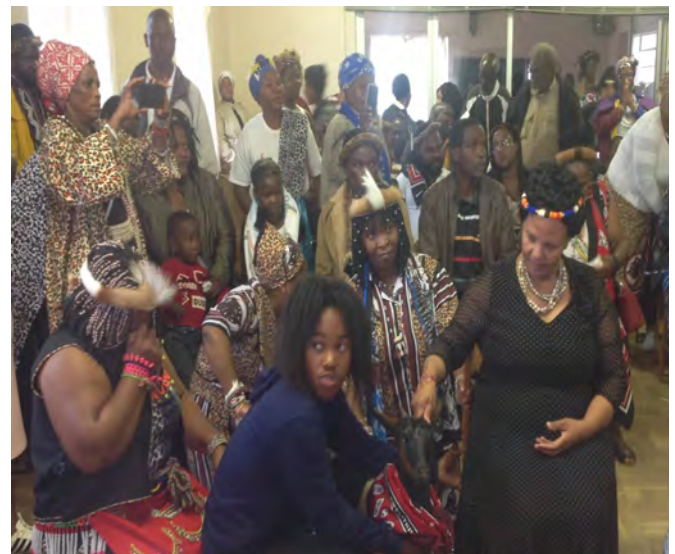
Former CEO receiving her present from the THP