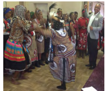
Traditional health practitioners structure launch on page 03