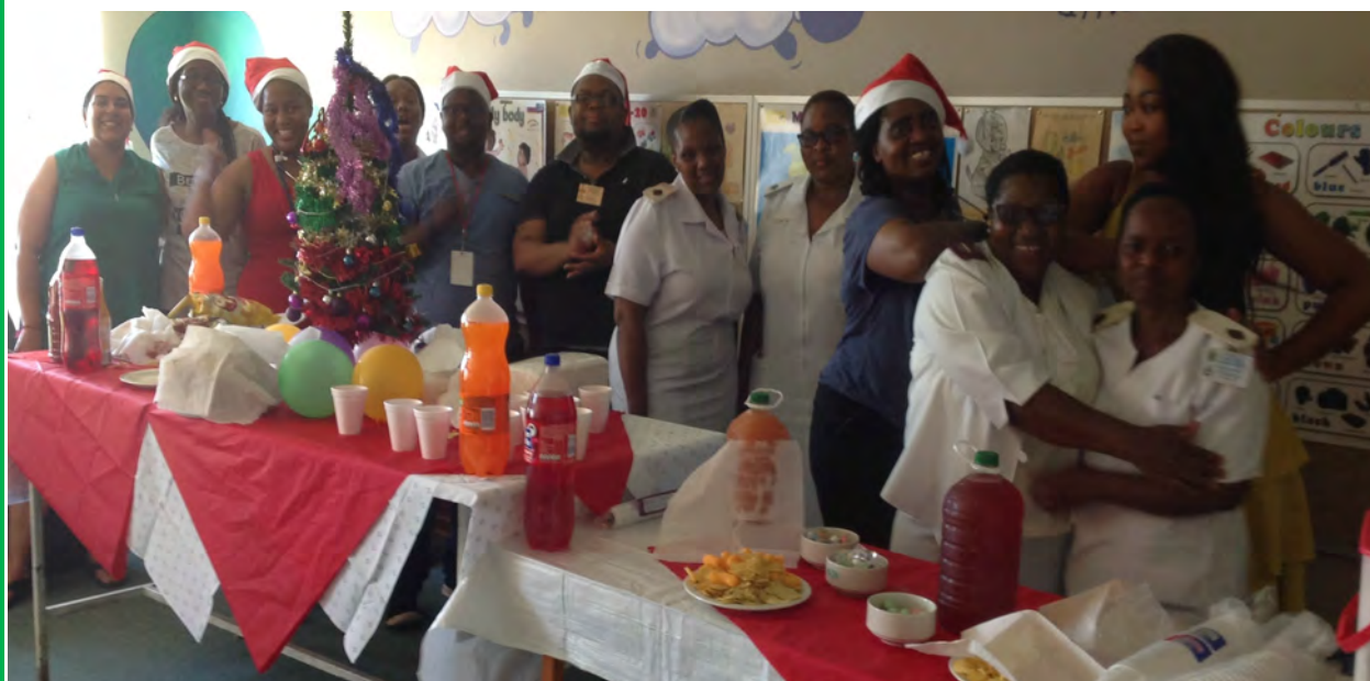
Pediatric ward staff. Nurses and doctors who organized the Christmas Party.

It may just be one day a year, but the pediatric Christmas party is a day that the kids remember all year-round. The party was thoroughly enjoyed by everyone that attended, but would not have been possible without the generosity of our Doctors and peads staff who donated both their money and time to ensure that these kids enjoy their Christmas in hospital. For sick children who spend time in hospital, being able to enjoy something that takes their mind off their condition and allows them to be a child is a very special gift. The children departed holding their presents, Christmas decorations and cookies, with the biggest smile on their faces. The hosts were pleased to see the joy on the children faces. The hospital management would like to thank everyone who played a role in ensuring that the day becomes a success.