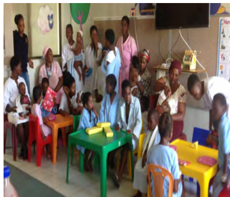
Christmas party for kids at pediatrics on page 02