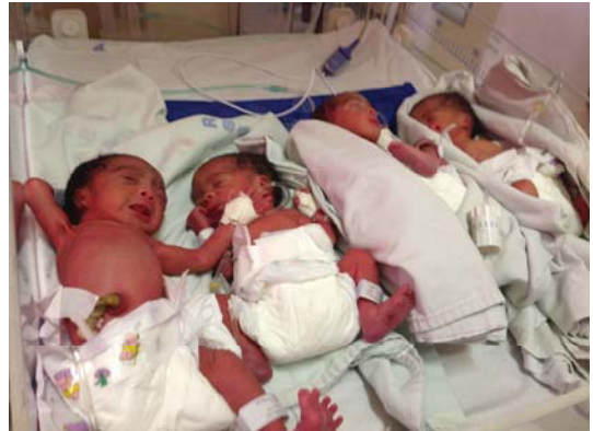
QUADROPLETS IN THEIR CRIB AFTER BIRTH