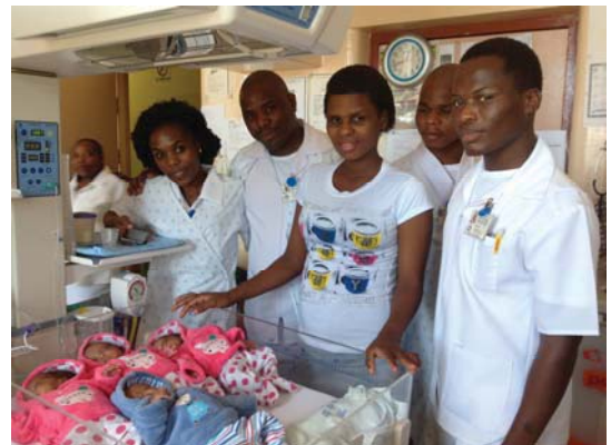
MOTHER OF THE QUADROPLETS AND NUSERY STAFF PREPARING TO GO HOME