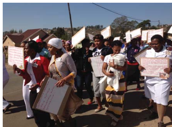
STAFF MARCHING TO CANAAN COMMUNITY CREATING AWARENESS