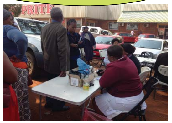
SCREENING OF TB, HCT, MINOR AILMENTS WERE DONE