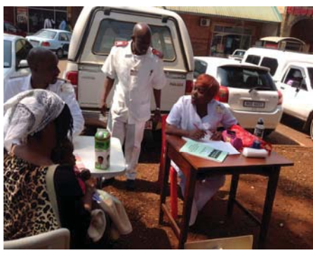
PHC STAFF TREATING CLIENTS