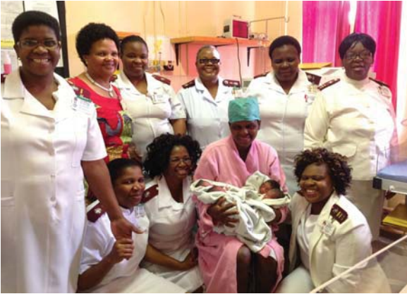
MIDWIVES WITH THE MOTHER OF THE QUARUPLETS AND THE CEO