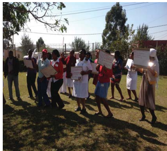
STAFF SINGING SONGS OF BREAST FEEDING