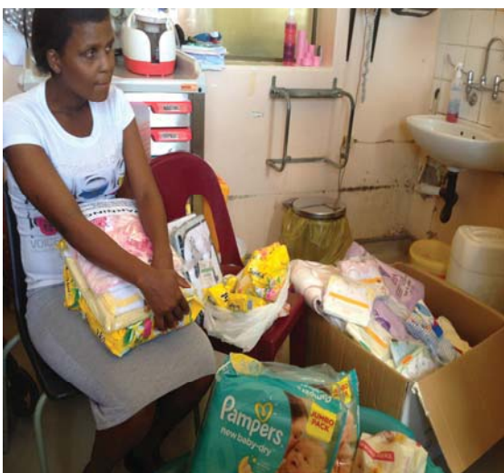
MOTHER OF THE QUADROPLETS WITH THE DONATIONS RECEIVED FROM HOSPITAL STAFF AND INDIVIUALS AROUND KZN AND PRETORIA