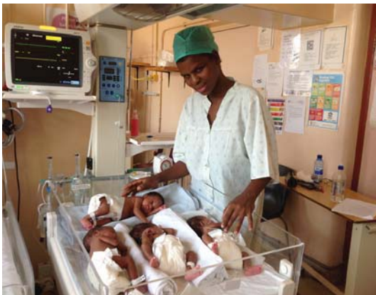
QUADRUPLETS AND THEIR MOTHER RETURNING FROM N.P.A