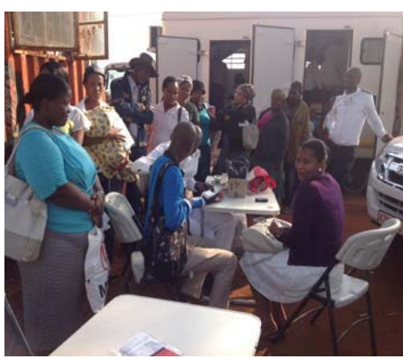
COMMUNITY OF NONGOMA CAME IN NUMBERS