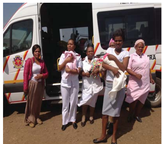
THE QUADRUPLETS ARRIVED AT HOME TRANSPORTED BY EMRS BUS ACCOMPANIED BY MARTENITY STAFF