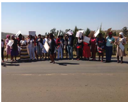
BENEDICTINE STAFF SENSITIZING COMMUNITY ON THE IMPORTANCE OF BREAST MILK