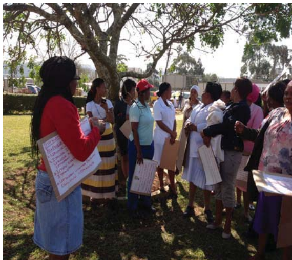
DIETICIAN ADDRESSING STAFF ON THE IMPORTANCE OF BREAST MILK