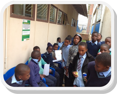
Ingane zeskole zaziphume ngobuningi bazo zizosoka