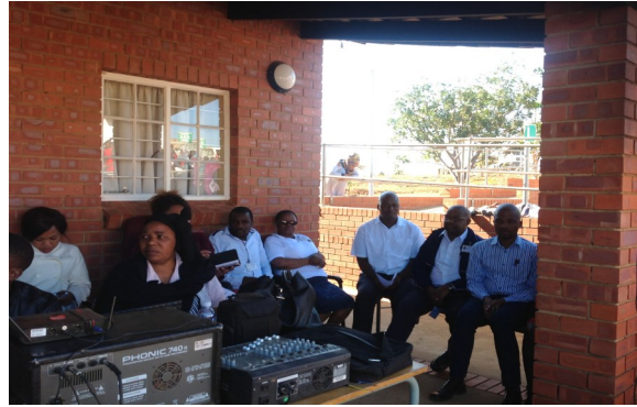
Sovane Clinic OM sitting with PHC staff