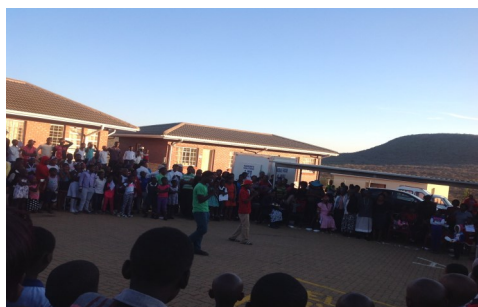
Young people showcasing their music talent