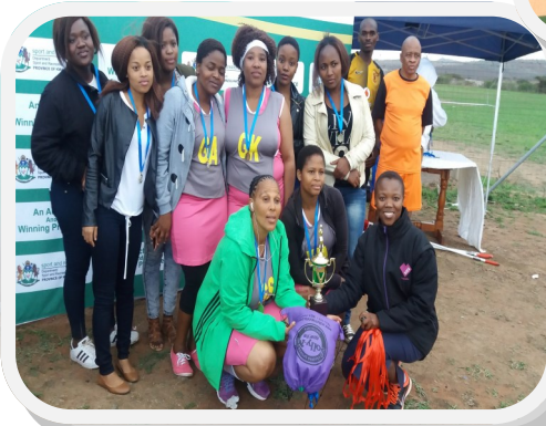
Benedictine Netball team after winning the trophy