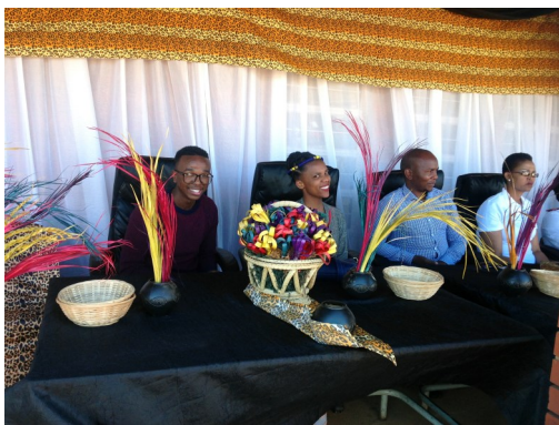
Main Table : Nongoma FM presenters , and Love Life manager , PHC Manager.