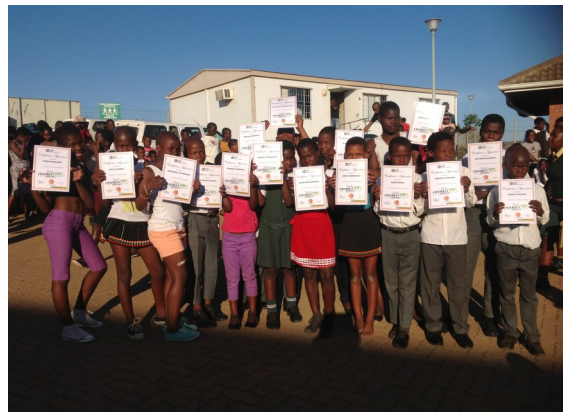
Sovane youth awarded with certificates of attendance during “Happy Hour”