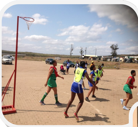
Benedictine Netball team playing with Nkandla