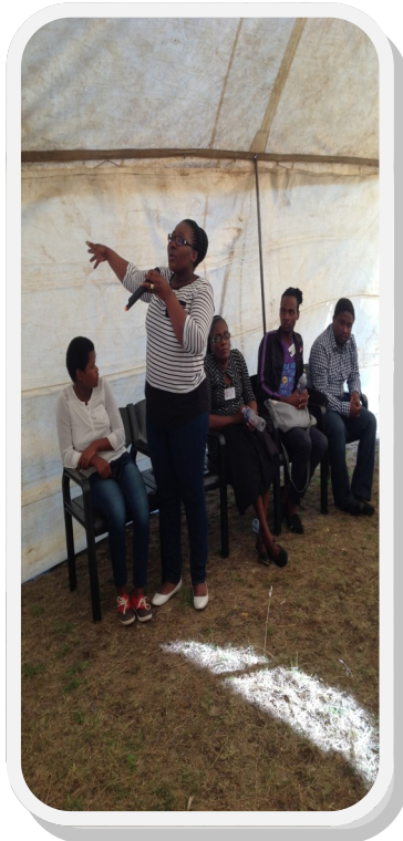
OM- Ndlozane Clinic talking to young people