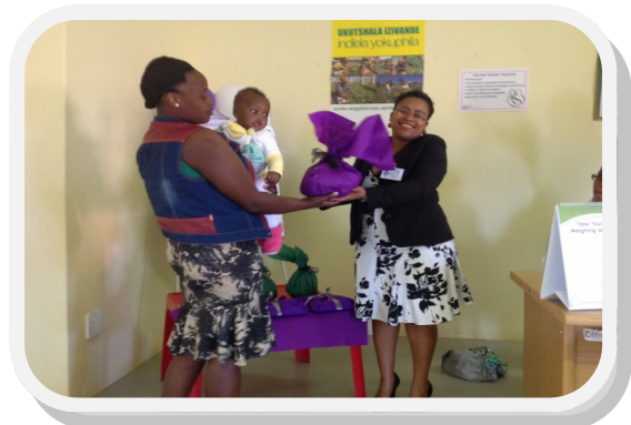
The District Dietician supported our institution by organizing prizes for the Mothers who participated during the breast-feeding week . The babies were weighed and breastfed .