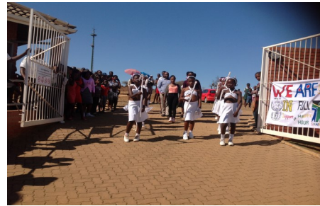
The dignitaries were escorted by drum majorettes from Sovane Primary School