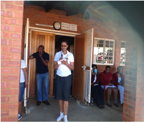
PHC Manager shared the purpose of the event