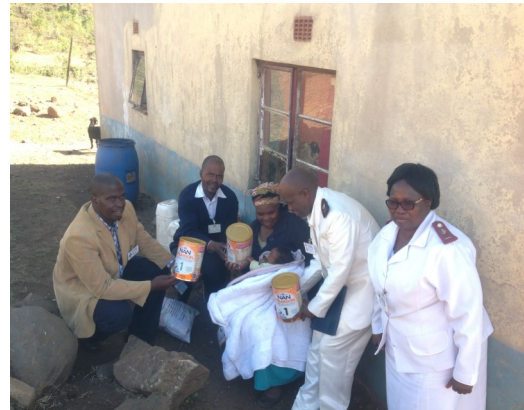
Hospital Ceo, with OSS Co-ordinator , ANM –OPD, PHC Supervisor handing over milk to the grandmother.