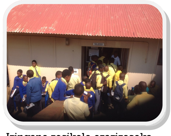
Izingane zesikole ezazizosoka