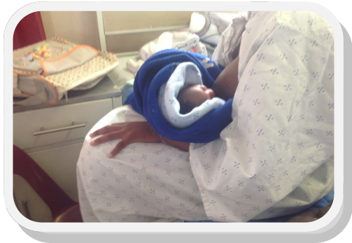
A young mother breastfeeding her baby in the maternity ward