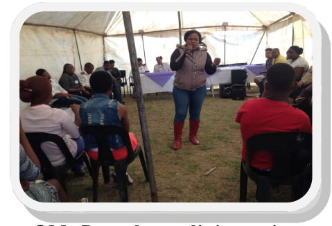
OM- Buxedene clinic motivating young people