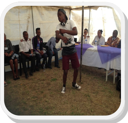
Young people showcasing talents on music