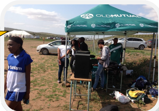
Old mutual as a main sponsor for the event came to support the teams