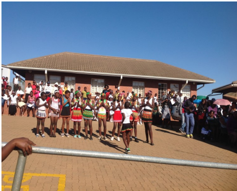
Traditional dance was performed by children from Sovane primary school