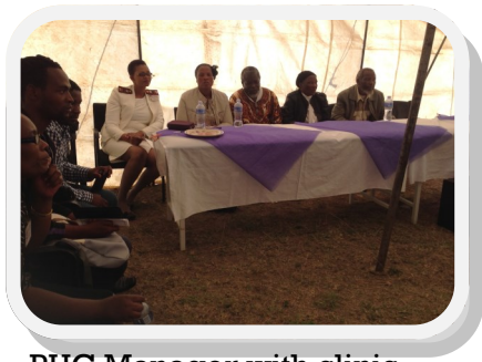
PHC Manager with clinic committee and officials from various Departments