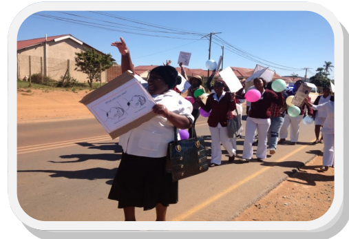
The nurses , ccg,s Dieticians, and hospital staff creating awareness on the street holding placards promoting breast feeding to the community