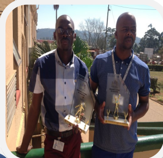
The trophies that were won by netball and soccer team at Msinga