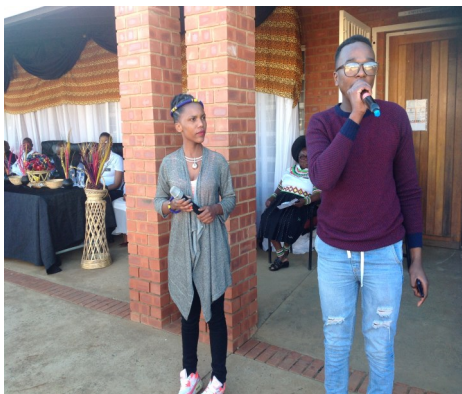
Nongoma FM presenters motivating Sovane youth, on importance of Education and making right choices in life