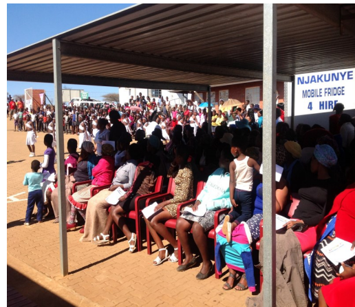
The community of Sovane came in numbers to support the youth event