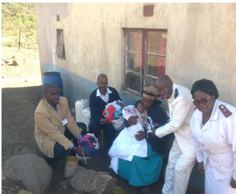
Hospital Ceo, with OSS Co-coordinator , ANM –OPD, PHC Supervisor