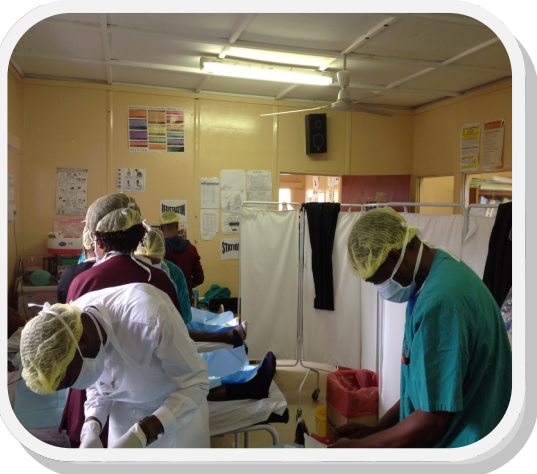
Odokotela noNesi besoka abesilisa