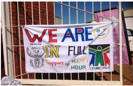
The slogan for youth friendly services slogan was displayed at the gate