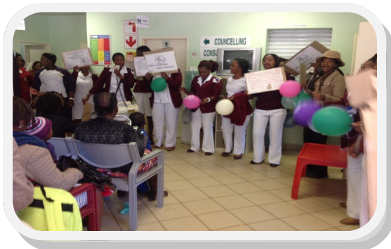
The nurses educating mothers on importance and advantages of breast milk at Queen Nolo-nolo clinic