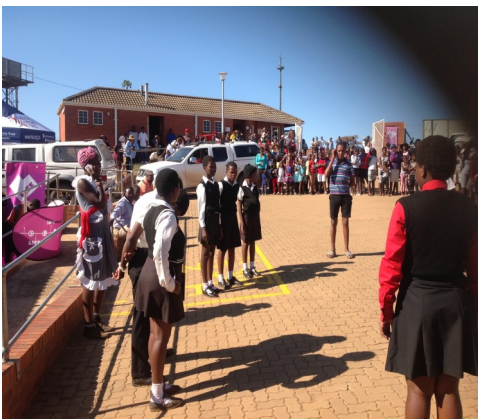
Sovane youth Role playing a story on the consequences of parents not observing childrens rights