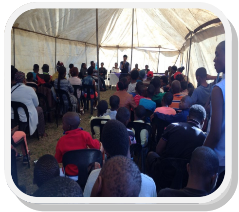
Youth at Ndlozane clinic came to support the launch

On the 30 of June 2016, Ndlozane clinic launched Youth Friendly services. The aim is to zoom in to young especially those who are sexually active , they also need top access to a variety of reproductive health and HIV services . Ndlozane clinic introduced a “a Happy Hour” to the youth of Ndlozane. They had speakers from Love Life, OM,s from various clinics, and officials from various Departments and NGO,s. The youth was given information on career guidance, importance of knowing one,s health stafus, and to motivate them to study hard so as to succeed in life. They were also encouraged to live a healthy lifestyle, by involving themselves in sporting activities in the area. The youth of Ndlozane came in numbers to support the launch . The OM at Ndlozane clinic thanked all stakeholders who supported and made this event a success. There were youthful activities happening on the day and information sharing.