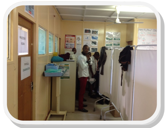
Abesilisa Belindele ukusokwa

Umkhankaso wokusokwa kwabantu besilisa {MMC} owaqala ngezi 12/09/2016 kuya 16/09/2016. lomkhankaso lapho abesilisa bebephume ngobuningi babo nokulapho isibhedlela sethu Benedictine hospital yasoka abesilisa ababalelwa ema 211 okujabulisa kakhulu ukungatholi izikhalazo ngabasokwa kodwa kube yizincomo zodwa lokho okufakazelwa nayithimba lo dokotela nabasebenzi bethu abasezingeni eliphezulu ngokuqeqeshelwa ukusokwa kwabantu besilisa. lomkhankaso waba yimpumelelo konke kwenzeka ngendlela neyaba impumelelo enkulu