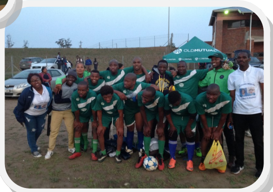
Benedictine Hospital Soccer team after beating Ceza Hospital and Thulasizwe Hospital

Kube wuchungechunge ezinkundleni zemidlalo eMona Sport Ground lapho bekunezimidlalo ezehlukahlukene ebekungunobhuntshuzwayo, umnqakiswa- no, umdonsiswane wentambo Kanye nezivocavoce. Kwazise phela isiBhedlela sakwaNongoma besimeme izibhedlela ezahlukahlukene okubalwa Itshelejuba, Thulasizwe. Vryheld Kanye neNkandla lemidlalo ibe yimpumelelo enhle kakhu- lu nalapho kuqapheleke ukubambisana kubasebenzi bezempilo bejabulela lile- isasa lezemidlalo lemidlalo ibinxaswe yinkampani yomshawalense yakwa Old Mutual isibhedlela sakwanongoma(Benedictine) ebholeni lezinyawo sidle um- hlanganiso kwathi, isibhedlela saseVryheld ebholeni lomnqakiswa no sahamba phambili sihlula Itshelejuba. Izinsizwa zasenkandla zizihudulele iBenedictine ngentambo kuwoMdonsiswano wentambo.