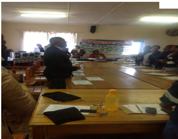
Staff members on a stretch break