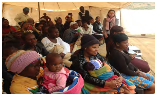
Mothers with their babies listening to our guest speakers talking about the importance of breastfeeding and breast milk

On the 8 th August 2018 Benedictine Hospital and Sovane Clinic hosted a breastfeeding function at Sovane clinic. The aim of the event was to promote awareness to mothers, pregnant women and those that are planning to have children on the importance of breast milk and breast feeding. Breastfeeding is the foundation of life. Breastfeeding is the most natural way to feed babies. It provides all the nutrition baby needs during the first six months of life, satisfies their hunger and thirst at the same time. It also helps to create a loving bond between mother and baby. The breast milk has got nutritional value to babies and it is affordable. Breast milk Is the best!