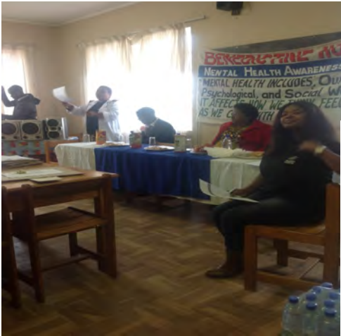
Occupational Health Nurse, EAP, addressing staff on mental health issues