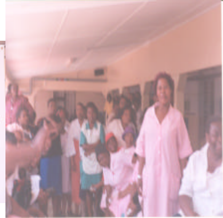
THE STAFF OF BENEDICTINE HOSPITAL ATTENDED QUALITY

The guests were greeted by the huge banner that declared who we really are and what we stand for at BENE-DICTINE HOSPITAL