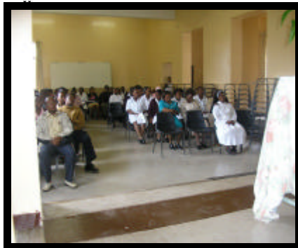
MANAGENT AND STAFF WELCOMING