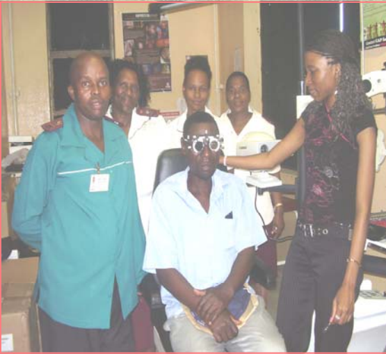
Optometrist with the OPD Area Manager, staff and