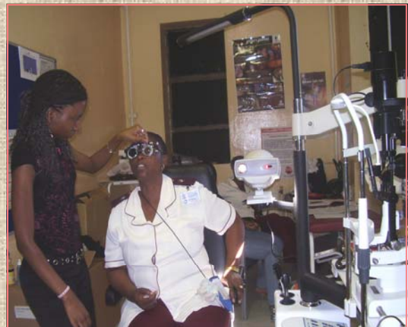
Optometrist examining one of staff member

The equipment was donated by standard chartered bank for the hospital. The clinic is doing very well, patients from around Nongoma are benefiting and also Hospital staff are also benefiting as well. Challenges we are facing is the lack of transport to visit other district Hospital (outreach Programme). Number of patients seen on average are 150 per month.