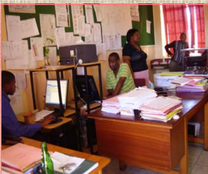
HUMAN RESOURCES STAFF, USING THE SYS-

HR UNIT RECENTLY INSTALLED BIOMETRIC SYSTEM TO THEIR COMPUTERS , THE PURPOSE IS TO REDUCE FRAUDULENT ACTIVITIES AND TO PREVENT RISK OF HAVING ACCESS TO PERSAL NUMBERS. ONLY THE HR MANAGERS TO HAVE ACCESS TO PERSAL NUMBERS. THEIR THUMBS ARE REGISTERED TO ACCESS THE COMPUTER .