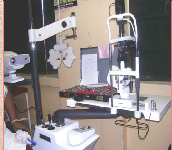
NEW EYE MACHINE DONATED BY ICEE