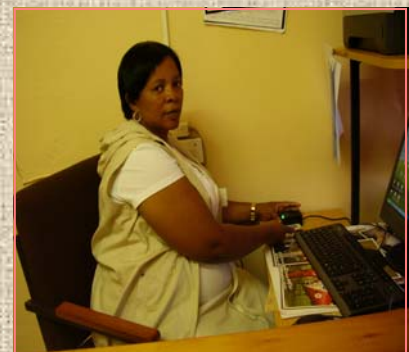
CHIEF HUMAN RE-SOURCE OFFICER , USING THE SYSTEM