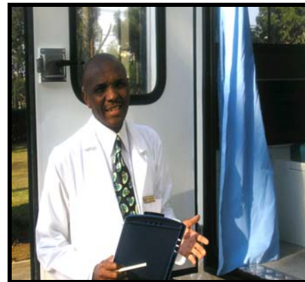
U-DKT. MM Makhanya-emukela iklinik entsha.