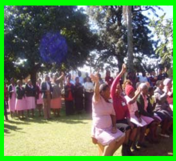
Staff singing praises