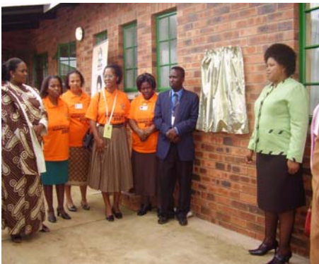
Mec, opening hlengimpilo clinic