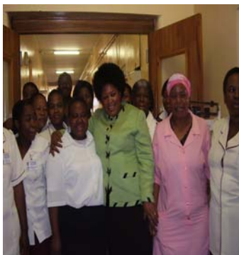
Mec, with Benedictine staff