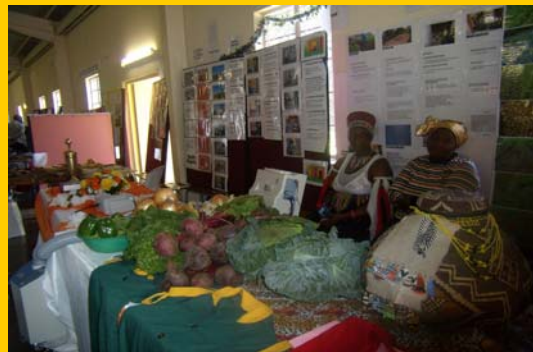
Onompilo displayed their work