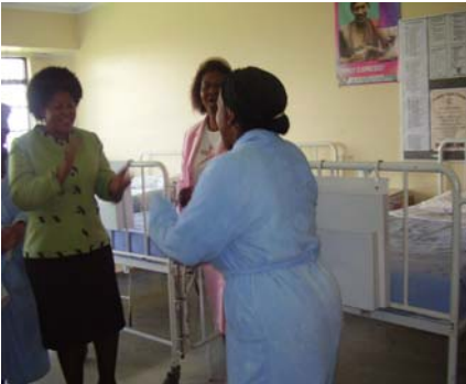
Mec, with psychiatric patient