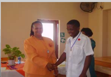
Ceo awarding the disciplined player

Sports awards 2007 held at sisters lounge/ hayi ke basebenzi lezi zizintsizwa nezintombi ezidle ubhedu kwezemidlalo ku nyaka ka2007 /indaba siyixoxa ngezithombe