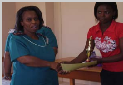
Nursing Manager awarding the best netball player