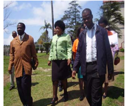
Mec taking rounds