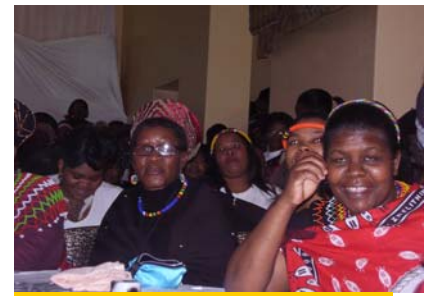
Nursing college teachers