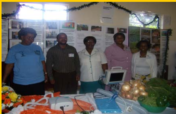
Staff from benedictine attended the event