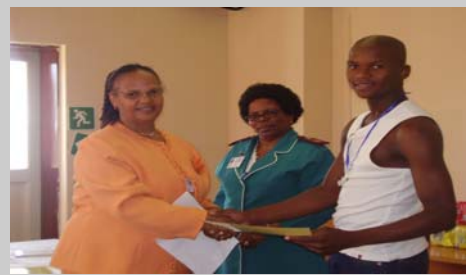
Ceo, awarding the best coach of the year