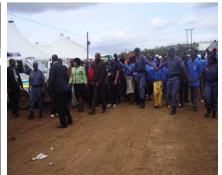
Mec, on arrival at the clinic