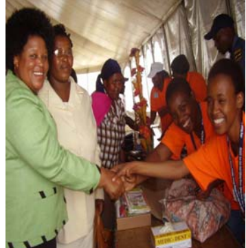
Mec, shaking hands with dental clinic staff