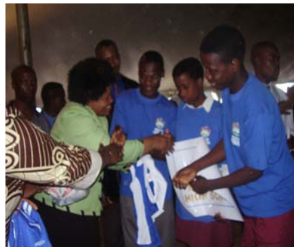
Mec, giving school kits