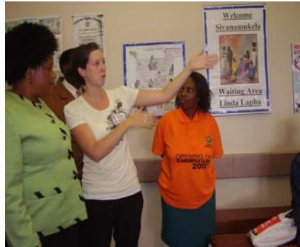
Mec at physio department