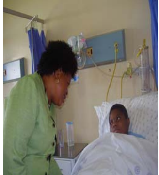
Mec, with a patient at medical ward