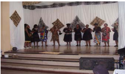
Students doing cultural dance