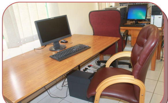
Donated desktop by UKZN MEPI in the Nursing School Library

“We Need More Family Medicine Specialist across Umkhanyakude”