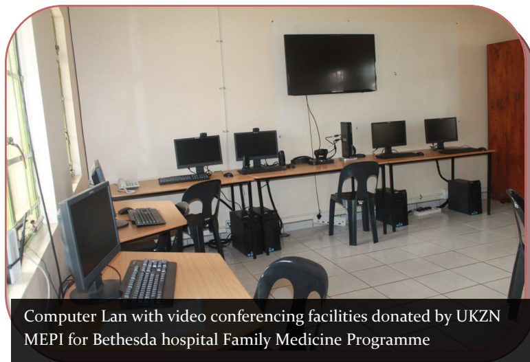
Computer Lan with video conferencing facilities donated by UKZN MEPI for Bethesda hospital Family Medicine Programme

Having a well-skilled generalist to co-ordinate training, supervise registrars and junior medical officers, and advocate for change in aspects of care and management systems has encouraged many of the medical officers to stay at Bethesda hospital. The morale amongst the team is high and health care workers at Bethesda hospital are beginning to take pride in the quality of health care services being offered.