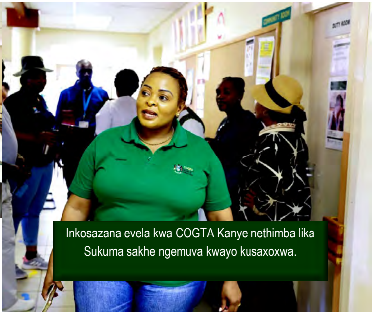
Inkosazana evela kwa COGTA Kanye nethimba lika Sukuma sakhe ngemuva kwayo kusaxoxwa.