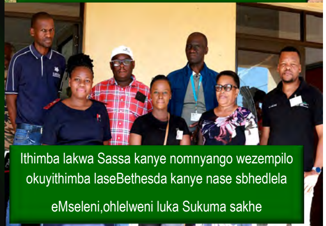
Ithimba lakwa Sassa kanye nomnyango wezempilo okuyithimba laseBethesda kanye nase sbhedlela eMseleni, ohlelweni luka Sukuma sakhe