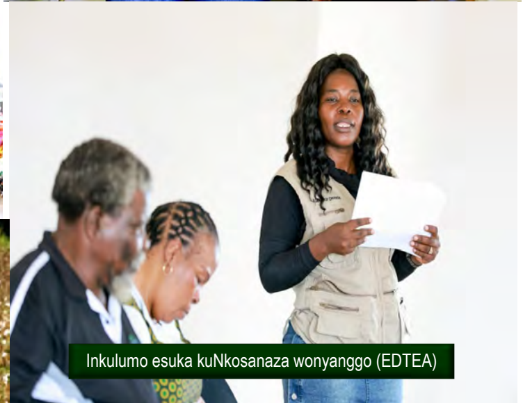
Inkulumo esuka kuNkosanaza wonyanggo (EDTEA)