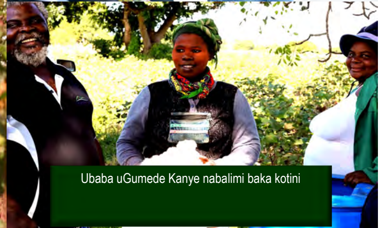
Ubaba uGumede Kanye nabalimi baka kotini