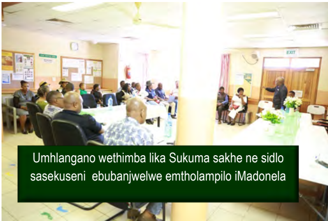
Umhlangano wethimba lika Sukuma sakhe ne sidlo sasekuseni ebubanjwelwe emtholampilo iMadonela