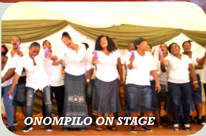
ONOMPILO ON STAGE