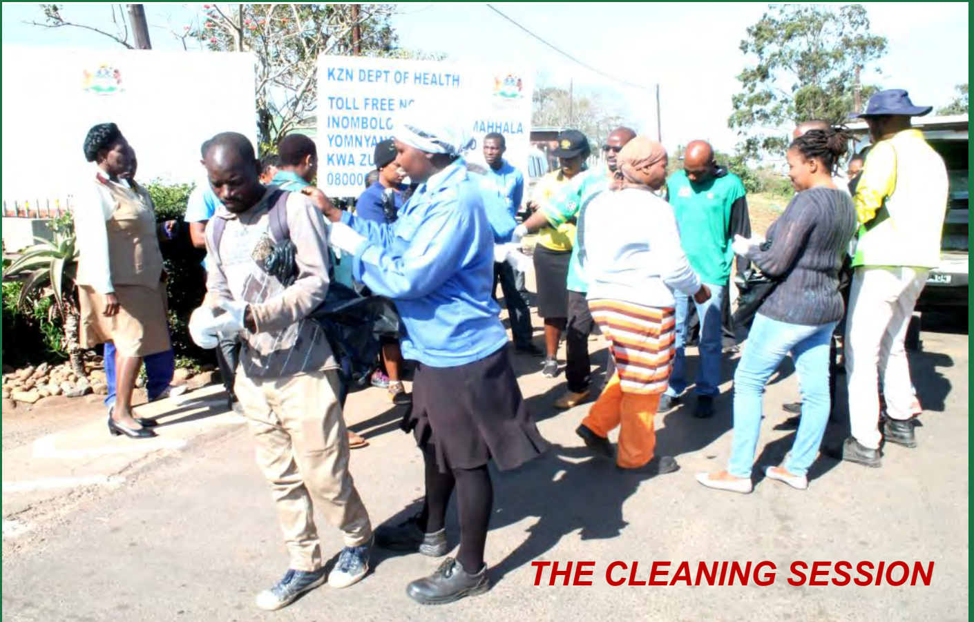
THE CLEANING SESSION