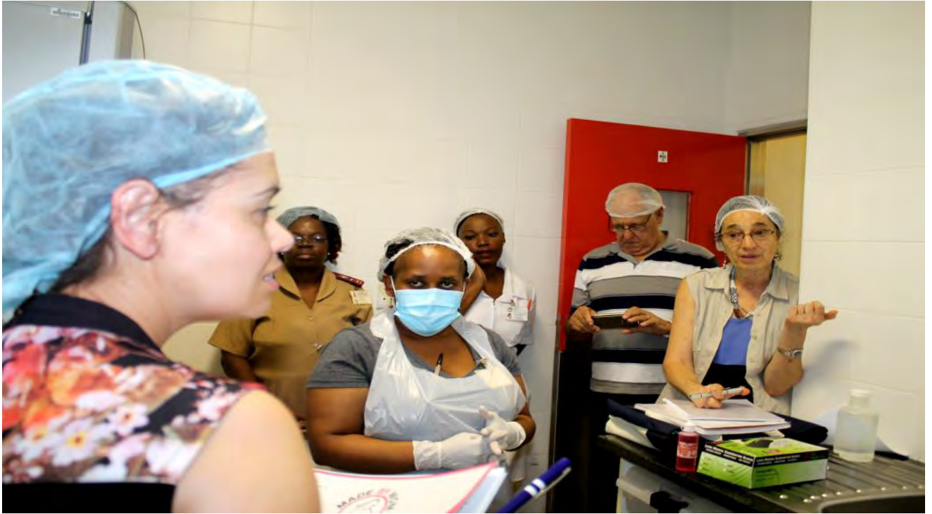
THE NUTRITION TEAM WITH THE LEGISLATORS DURING THE AUDIT