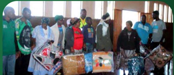
COMMUNITY MEMBERS RECEIVING BLANKETS