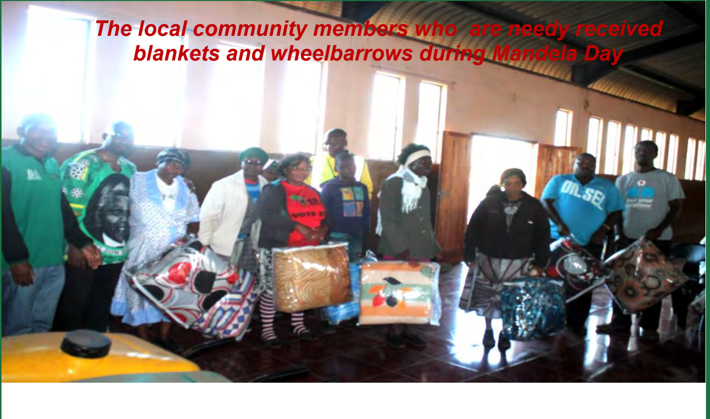
The local community members who are needy received blankets and wheelbarrows during Mandela Day