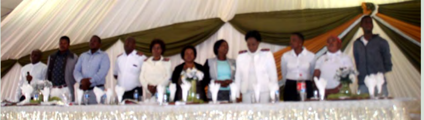
THE HOSPITAL'S MANAGEMENT WITH VARIOUS STAKEHOLDERS DURING THE WOMEN'S EVENT AT GEDLEZA , HLALANATHI HALL