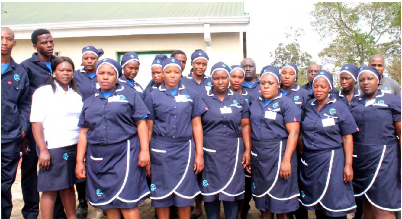
CHAIRSONS LOGISTICS STAFF MEMBERS