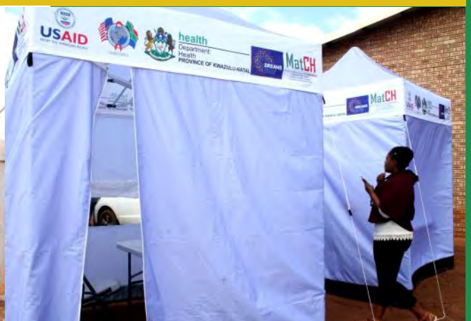
MATCH TEAM WHO SPONSORED WITH GAZEBOZ FOR THE EVENT