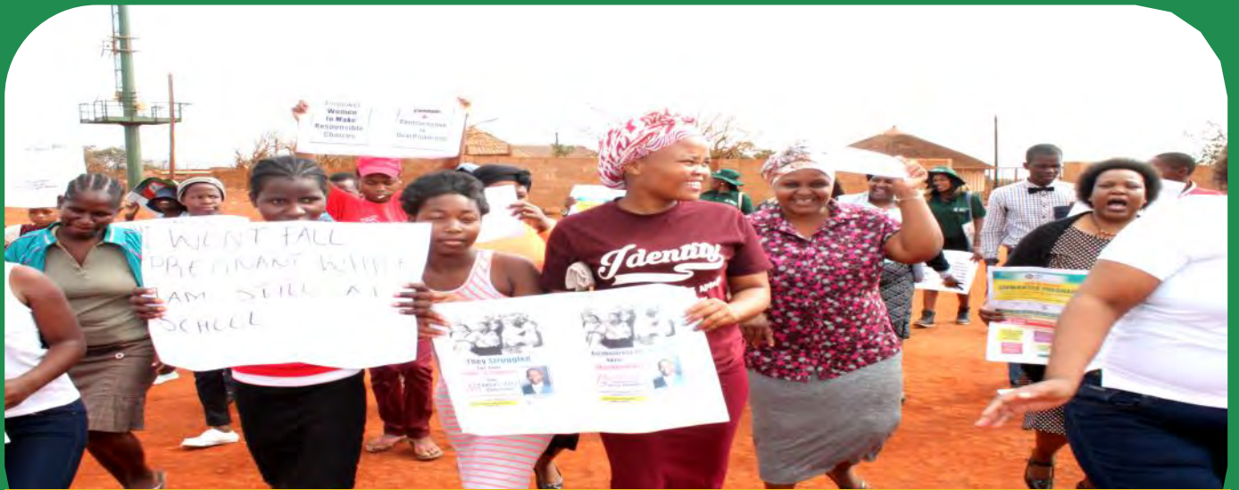
HEALTH WORKERS SPREADING THE “WORD” IN THE LOCAL COMMUNITY OF GEDLEZA