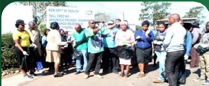
GOVERNMENT OFFICIALS WITH COMMUNITY MEMBERS DURING THE CLEANING SESSION