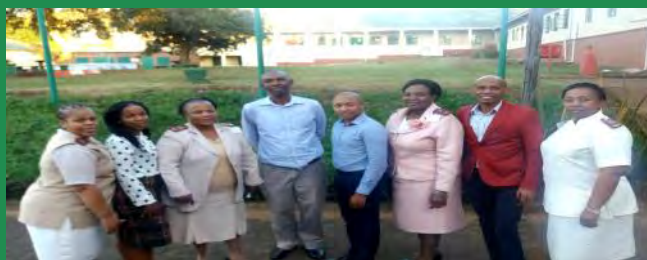
IPC AUDITORS WITH THE HOSPITAL'S MANAGEMENT ON THEIR DEPARTURE AFTER PRESENTING FINAL REPORT