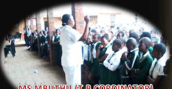
MS MBUTHU (T.B CORDINATOR) GIVING A HEALTH EDUCATION TO SCHOOL LEANERS.