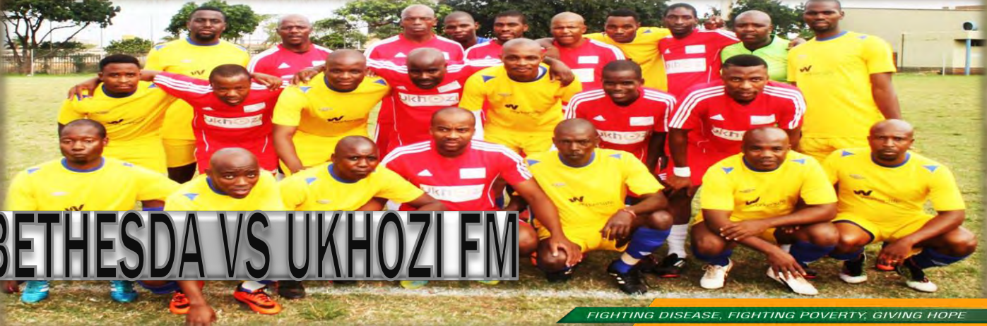
BETHESDA VS UKHOZI FM