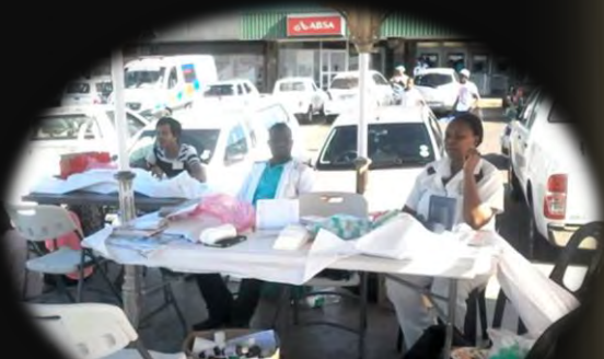
BETHESDA T.B TRACER TEAM SCREENING T.B AT JOZINI SHOPPING CENTRE