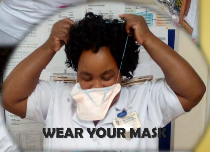
WEAR YOUR MASK