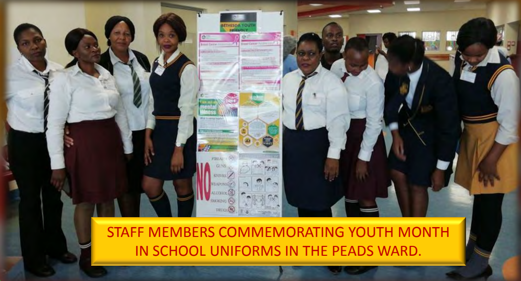
STAFF MEMBERS COMMEMORATING YOUTH MONTH IN SCHOOL UNIFORMS IN THE PEADS WARD.