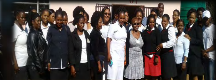
BETHESDA HOSPITAL EMPLOYEES WITH DIFFERENT STAKEHOLDERS