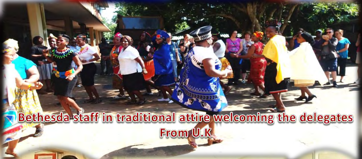
Bethesda staff in traditional attire welcoming the delegates From U.K