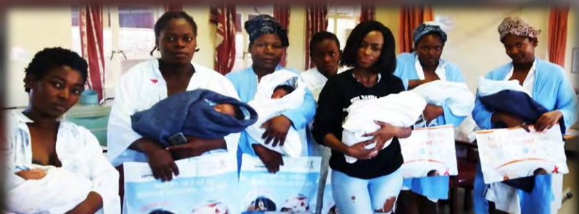
ACTING PUBLIC RELATIONS OFFICER IN THE MARTENITY DURING THE YOUTH DAY.