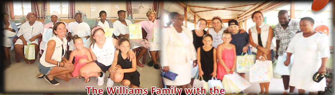
The Williams Family with the mothers in maternity