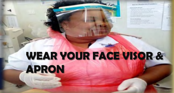
WEAR YOUR FACE VISOR & APRON