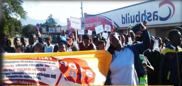
YOUTH CAMP, MKUZE