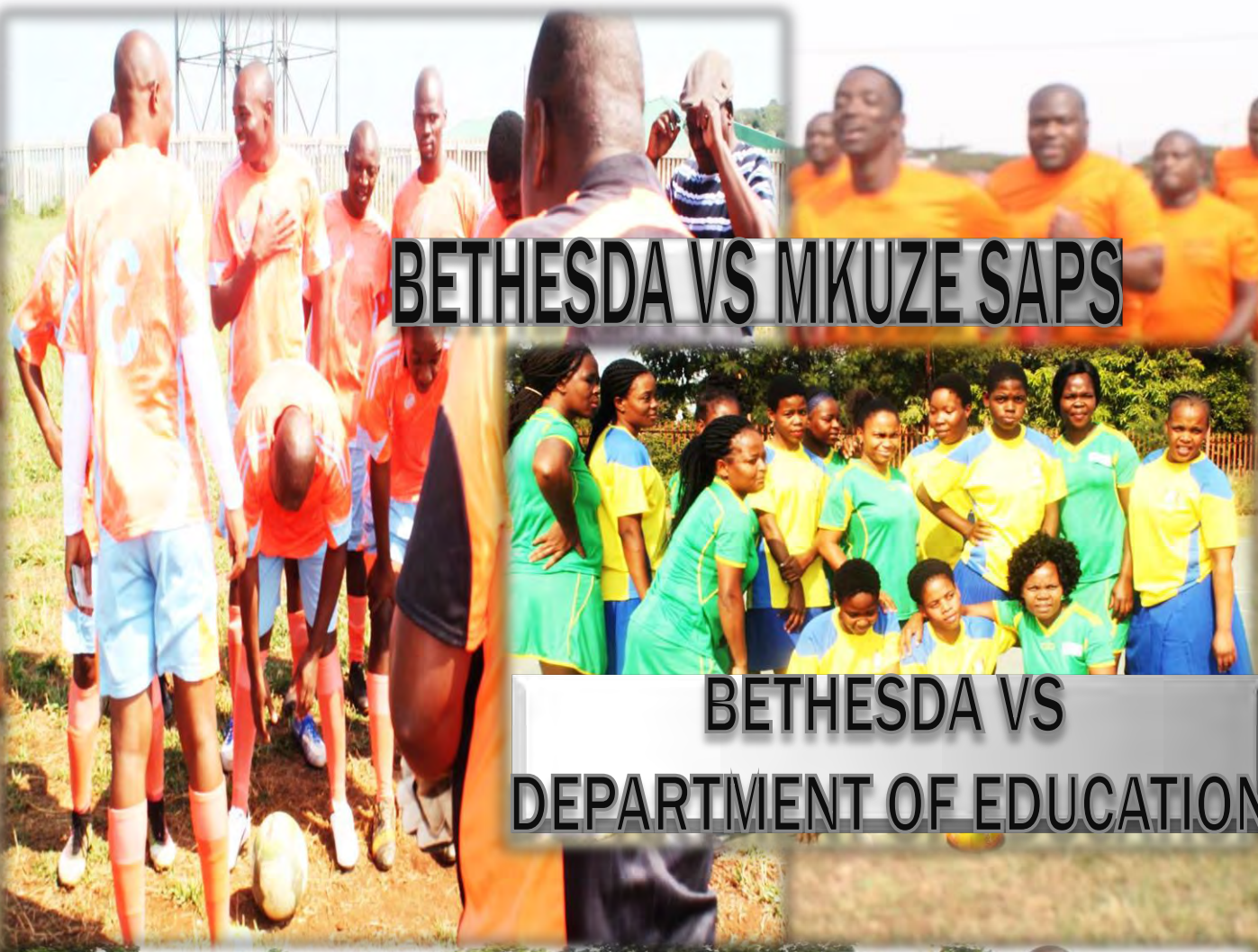
BETHESDA VS MKUZE SAPS