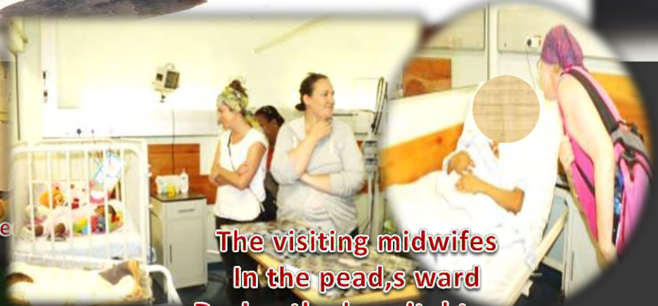
The visiting midwives In the paediatric ward During the hospital tour.