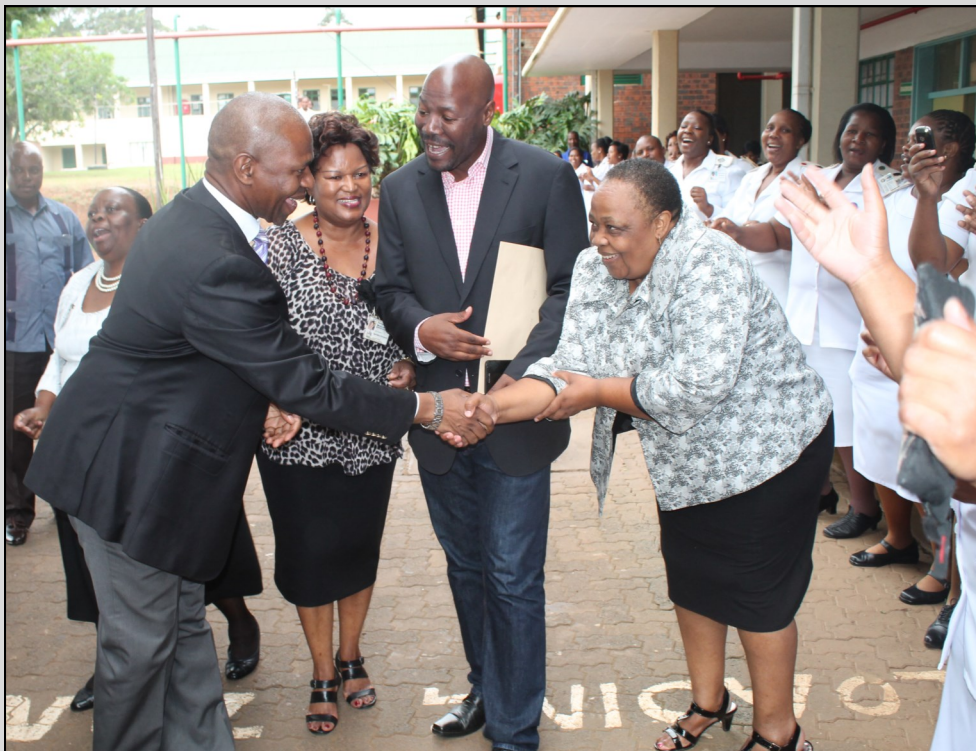
UMkhanyakude District management together with hospital Management welcoming Health MEC in Bethesda.

Bethesda Management contingency plans come out victorious in the most difficult times of the longest service delivery protest. A week long service delivery protest, convened by disgruntled Ubombo Community who opted to barricade all hospital access roads with stones. On top of the list of their demands was Water, Roads, and electricity.