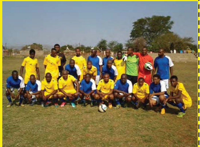
Bethesda Team B with Team B Prasa Metrorail

A s part of work and play relations. Moreover increased initiative endorsed by productivity of employees in their province of Kwazulu natal, Bethesda hospital teams went headlock with Prasa Metrorail. a challenge posed by Prasa Metrorail was staged at Mkuze sports Complex on the 29 of August 2015. Despite home ground advantage to Bethesda Hospital, Prasa Metrorail managed to resist conquest. Both team A and B on the male soccer were goalless draws. However team A for old timaz obted for penalties. Bethesda old timaz lost 4:3 on the shootout.