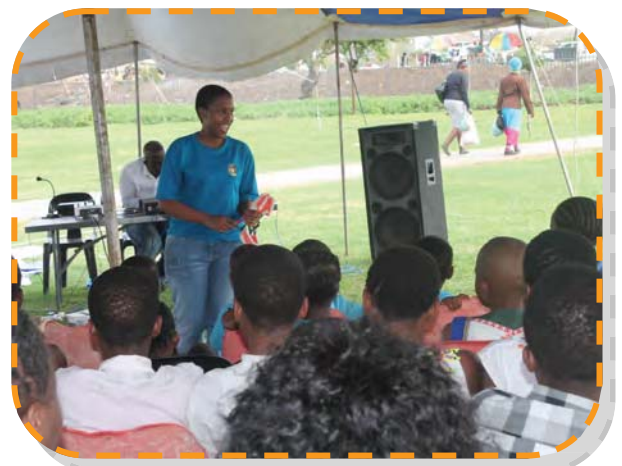
Oral Hygienist Teaching On How To Brush Like Dentist.