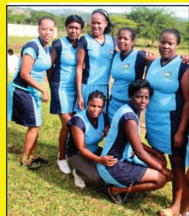
Bethesda Netball Team