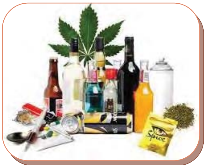
Common Drugs found in communities.