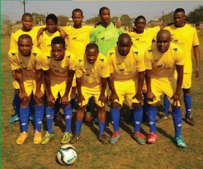
Bethesda Team B