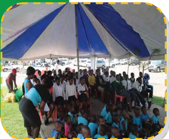
Creche, Nethsezeka Primary School, Izibukweni High School Were Amongst The Attendees