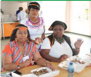
Umgxabhiso ubuconsisa amathe uhambisana nojeqe.

Bebevunule beconsa abasebenzi besibhedlela iBethesda. Ilowo nalowo edle imvunulo yesizwe sakubo