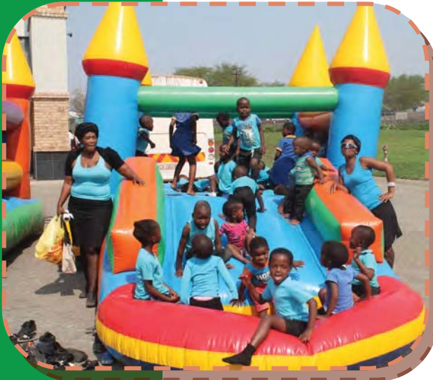
Creche Pupils Enjoying The Jumping Castle At the Oral Month Launch