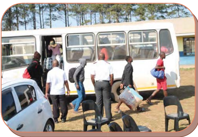
Abesilisa Abebezosoka. Batheleke Ngebhasi Lomnyango Wezempilo

iBethesda yingxenyeyombhidlango wokusoka abasilisa abangu 2.5 wezigidi ngo-2016.