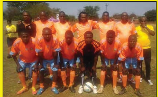
Bethesda Team A

Female netball also formed part of the challenge. Our ladies submitted fully to Durbanites. A good hiding 32:15 sent Bethesda ladies back to the drawing board. Work and Play initiative has played a significant role in enhancing work relations and intergovernmental