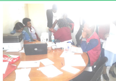
STAFF MEMBERS WHO WERE BUSY WITH THE REGISTRATION .