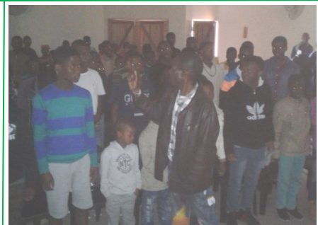
AMABUTHO SINGING DURING THE CAMP .