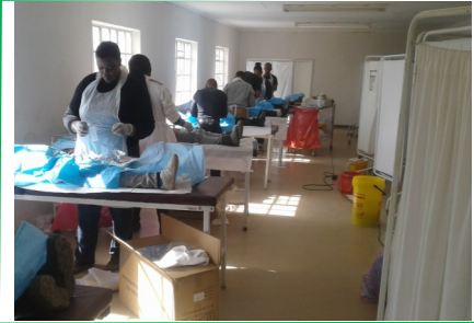
STAFF MEMBERS PERFORMING OPERATIONS DURING CAMP.