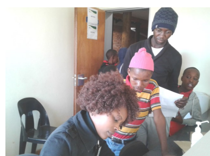
MS. NONTOBENKO BUSY WITH REGISTRATION DURING MMC CAMP .