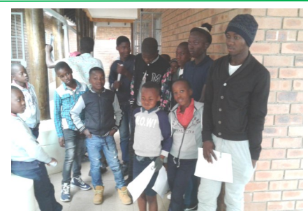
YOUNG MALES QUEUING FOR REGISTRATION .