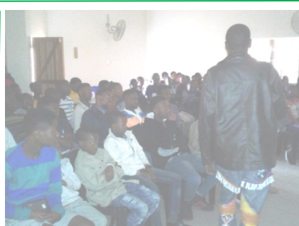
INDUNA LEADING AMABUTHO WITH TRADITIONAL SONG.