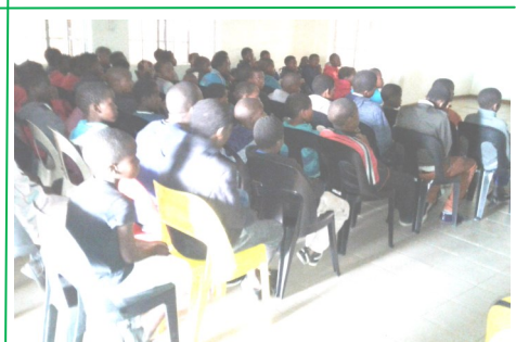
YOUNG LISTENING TO THE SPEECHES BY OFFICIALS DURING JULY CAMP