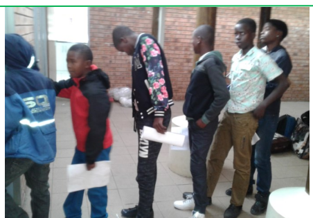
YOUNG MALES QUEUING FOR REGISTRATION DURING JULY HOLIDAY MMC CAMP.