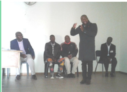
PRINCE NHLANGANISO ZULU ADDRESSING YOUNG MALES .