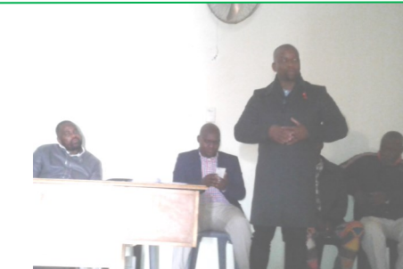
PRINCE NHLANGANISO ZULU ADDRESSING YOUNG MALES DURING THE CAMP .