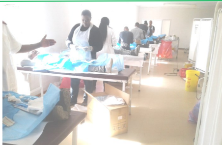
STAFF MEMBERS PERFORMING OPERATIONS DURING CAMP.