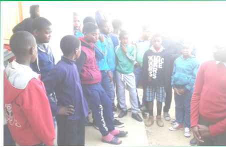
YOUNG MALES WAITING FOR REGISTRATION