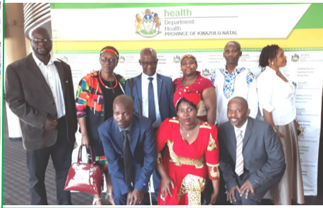
CJM Hospital Team taking pictures after Service Excellence