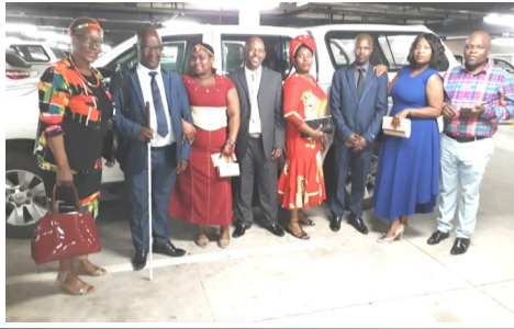
Arrival of CJM Hospital at ICC Durban during MEC's Awards