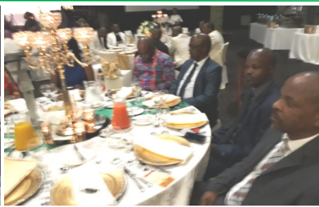
Other members of the hospital team who have attended Service Excellence Awards.