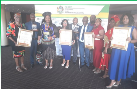
CJM Hospital Team showcasing their awards after the ceremony.