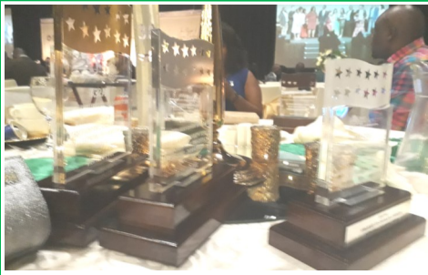
Awards that were awarded to CJM Hospital during MEC's Awards .