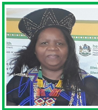
NAME SURNAME EDITOR