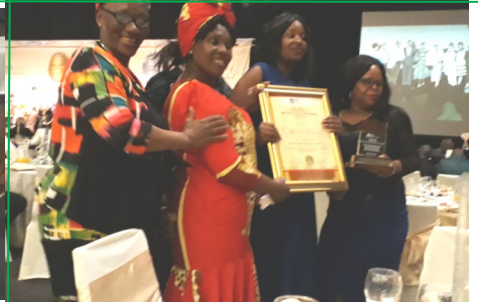
CJM Hospital Team posing after receiving their award