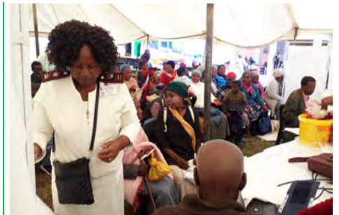
PROVISION OF HEALTH SERVICES DURING OPERATION MBO.

FIGHTING DISEASE, FIGHTING POVERTY, GIVING HOPE