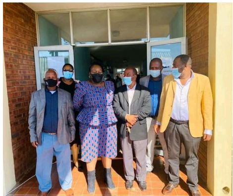
KZN MEC for Health with different stakeholders during her roadshow.