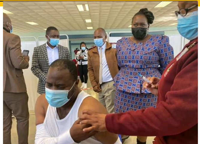
Inkosi Hlatshwayo taking vaccination during KZN MEC visit to CJM Hospital.

She further urged the elderly to encourage citizens around the vaccinated to keep their immunity up, especially as they continue to age and their body's natural ability to fight off disease is not as strong as when they were younger. They were encouraged to continue with social distancing, wearing of mask, washing of hands, even after vaccination.