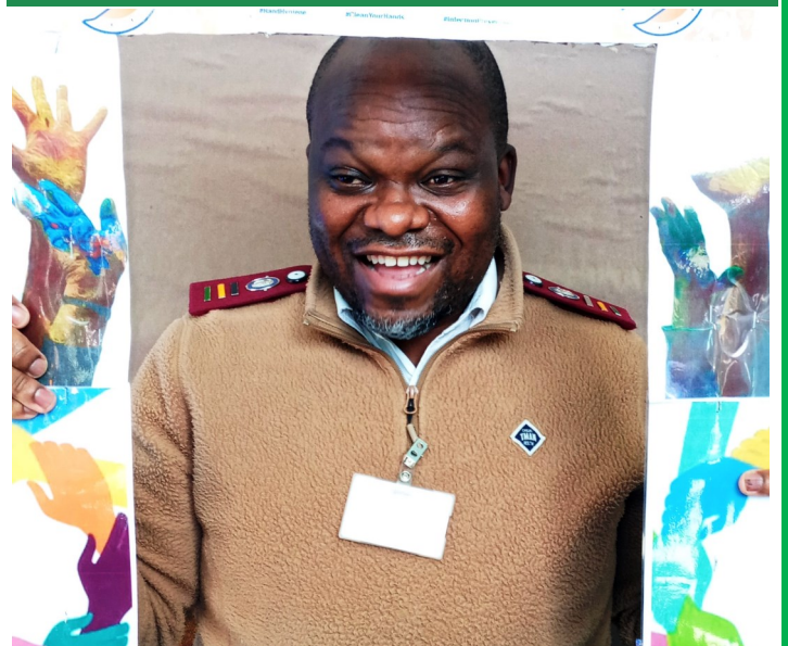
Infection, Prevention and Control Manager during Global Hand Hygiene Day