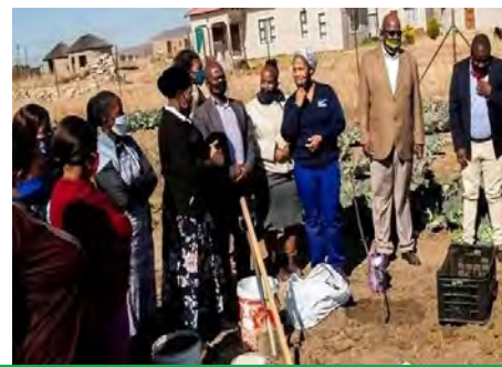
MEC WITH BENEFICIARIES DURING THE LAUNCH OF ONE HOME ONE GARDEN