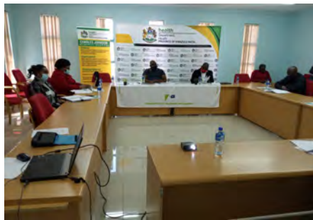
LEGISLATURE VISIT... READ MORE ON PAGE 1