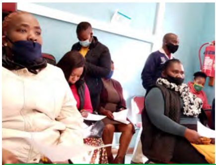
DEPARTMENTS OFFICIALS WHO HAVE ATTENDED MORNING BRIEFING