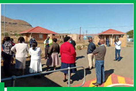
District, hospital and clinic staff during Legislature visit .