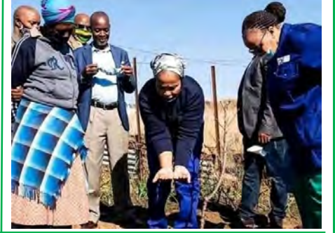
LOCAL LEADERSHIP ACCOMPANIED MEC DURING ONE HOME ONE GARDEN