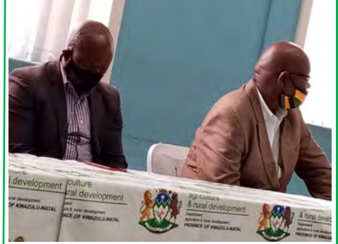
COSELLORS WHO HAVE FORMED PART OF THE BRIEFING