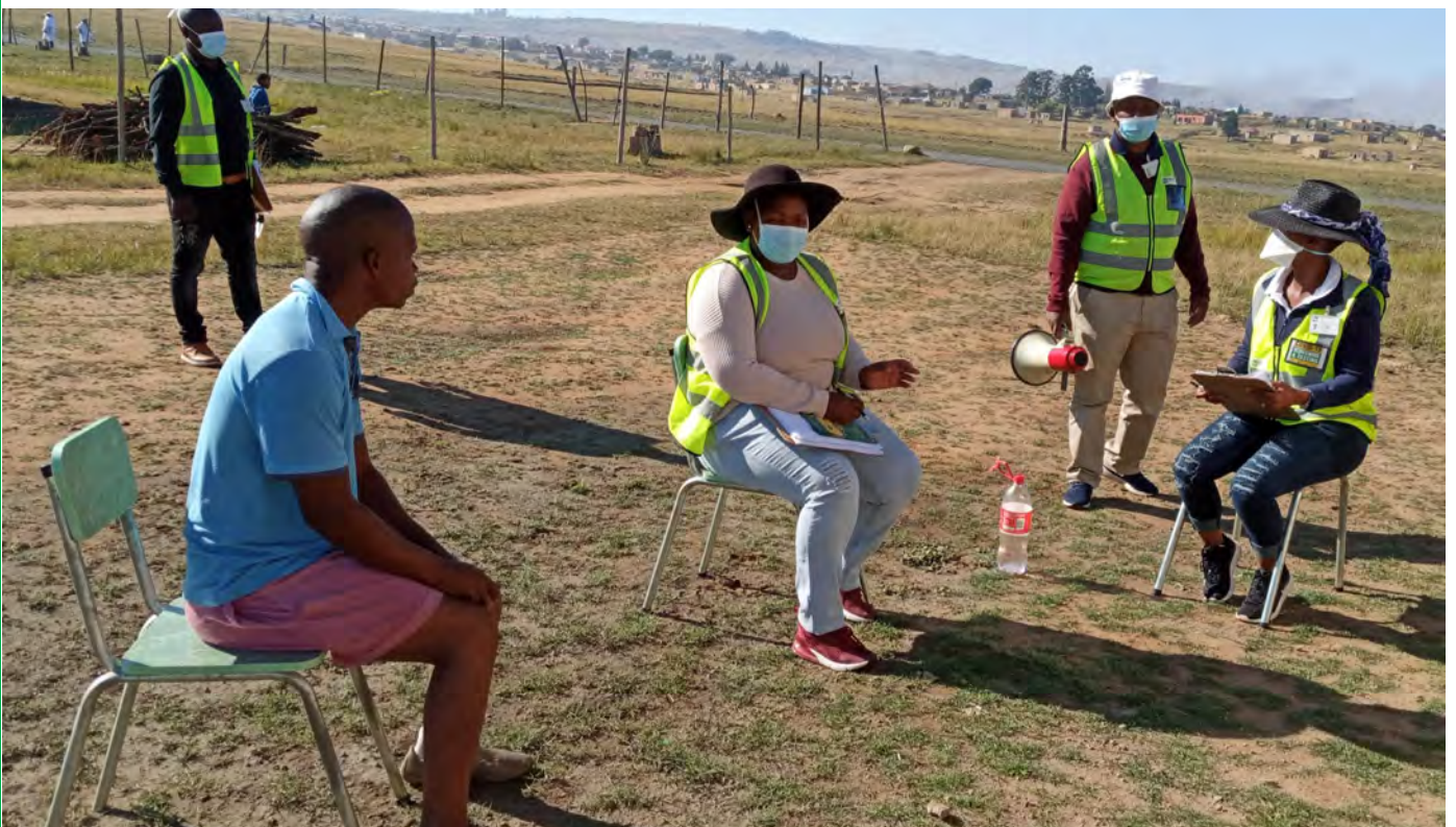
THE COMMUNITY OUTREACH TEAM CONDUCTING MASS SCREENING AT GUBAZI AREA IN WARD 11 UNDER NQUTHU AREA.