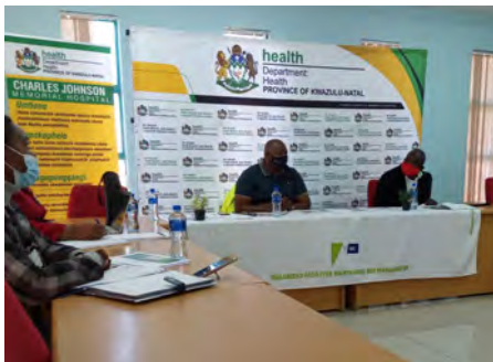
Legislature members listening to the presentation by the CEO

In terms of general operations, the institution has 15 fixed clinics and four mobile clinics servicing 76 mobile pours .With regards to preparedness for Covid-19 cases, the hospital have isolation for people under investigation and Covid-19 positive ward, although they would appreciate more human resource.