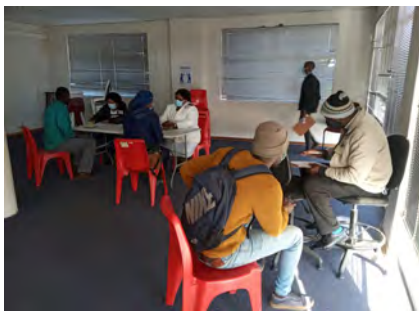
MASS AND HOTSPOT SCREENING...READ MORE ON PAGE 1