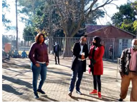
PROVINCIAL TEAM WHO HAVE ACCOMPANIED MEC