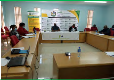
The Team members listening to presentation by the hospital CEO