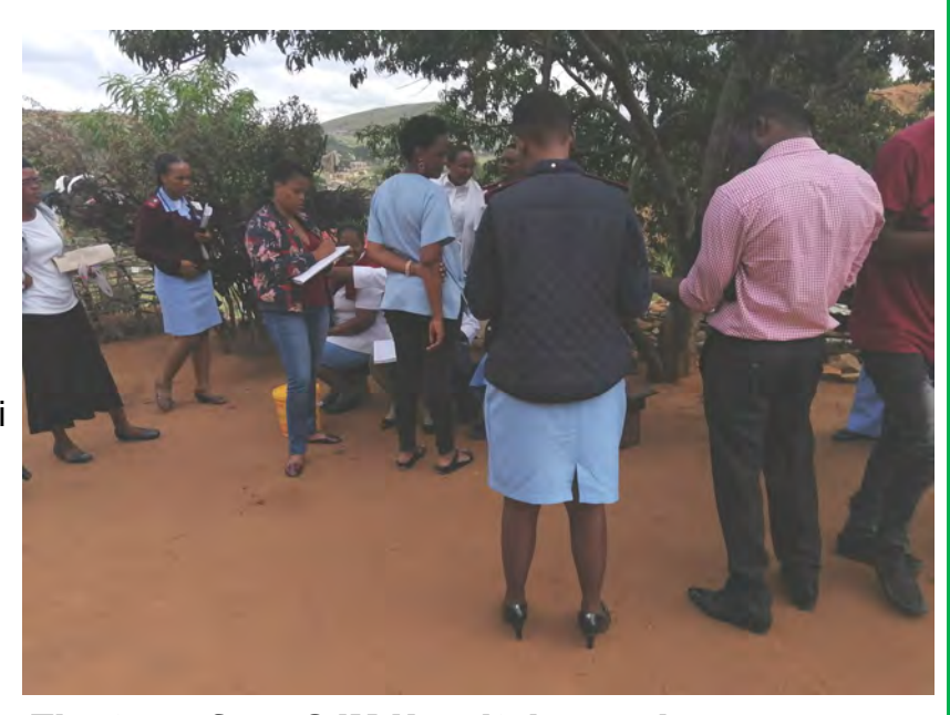
The team from CJM Hospital engaging on Nqo-nqo-Sikhulekile Ekhaya" initiative conducted at Ncepheni Area in Ward 01.

During this visit a comprehensive health care screening was done to seven households and 16 people were screened