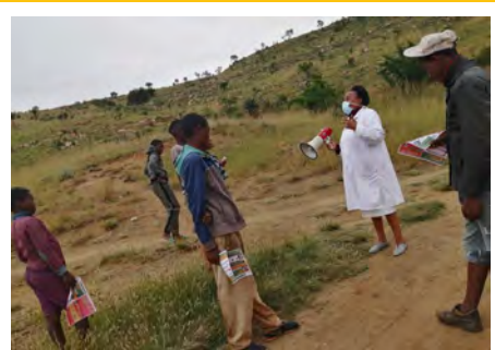
Loud Hailing for COVID-19... READ MORE ON PAGE 02