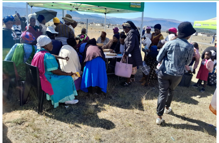
COMMUNITY MEMBERS ATTENDING REGISTRATION DESK BEFORE RECEIVING SERVICES.