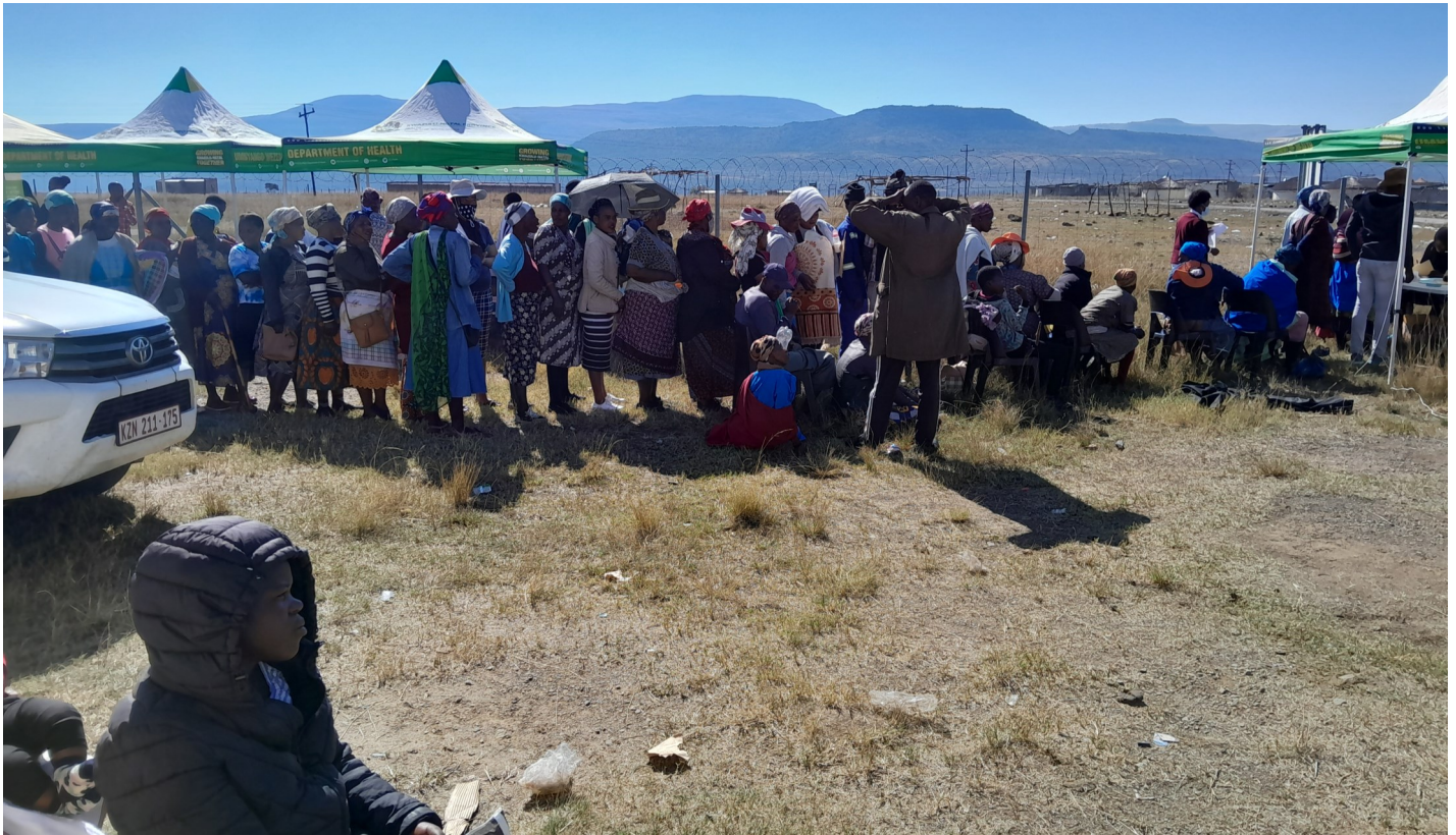
COMMUNITY MEMBERS QUEUING TO RECEIVE HEALTH SERVICES DURING COMMUNITY OUTREACHED PROGRAMME TO COMMUNITY OF QHUDENI IN WARD 01.