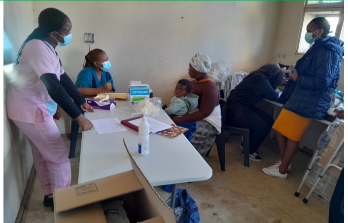
ALLIED WORKERS WERE PRESENT TO ATTEND TO THEIR CLIENTS .