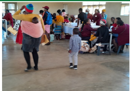
COMMUNITY MEMBERS WAITING TO RECEIVE HEALTH SERVICES.