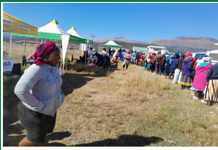
COMMUNITY MEMBERS WAITING TO RECEIVE HEALTH SERVICES.