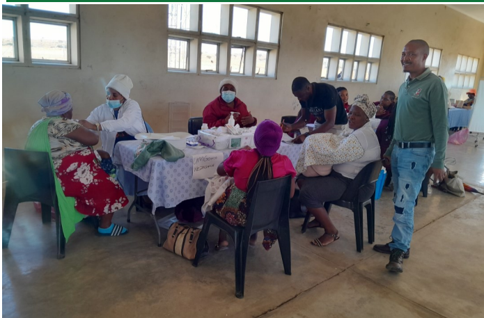
HOSPITAL STAFF MEMBERS ATTENDING TO THE COMMUNITY MEMBERS. .