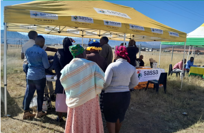
STAFF MEMBERS FRO SASSA WERE AVAILABLE TO ATTEND THEIR CLIENT DURING THIS PROGRAMME