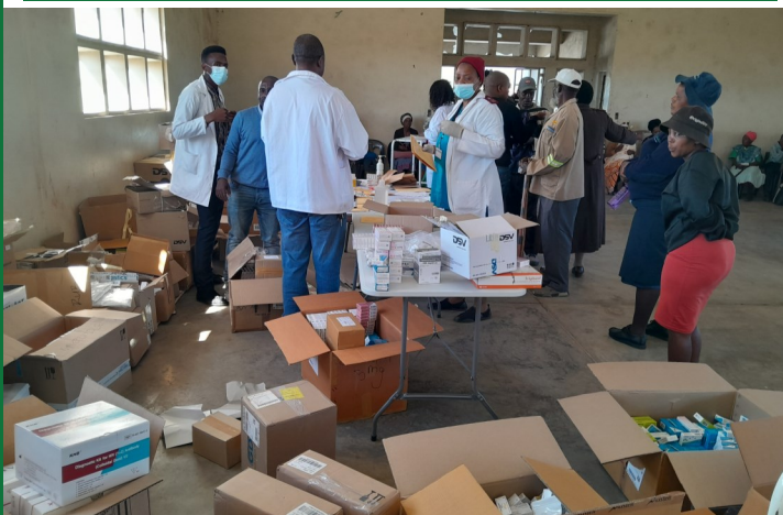
PHARMARCIST WERE ALSO PRESENT TO ISSUE MEDICATION TO COMMUNITY MEMBERS.