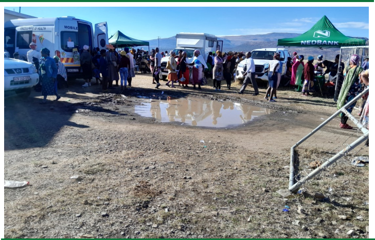
COMMUNITY MEMBERS ON THEIR ARRIVAL TO RECEIVE HEALTH SERVICES