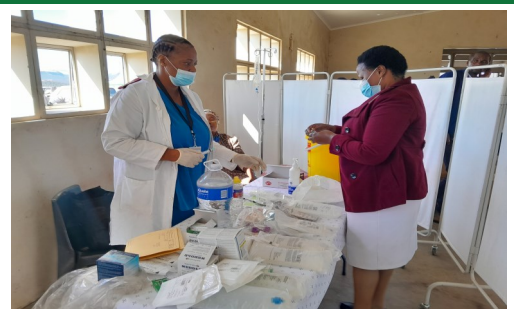
CJM STAFF MEMBERS PREPERING TO CONSULT CLIENTS.