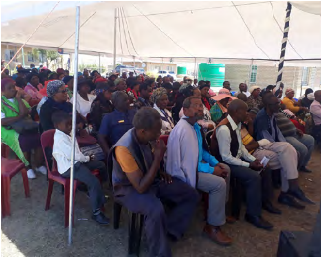
Community members who have attended the Open Day at Mhlungwane clinic.