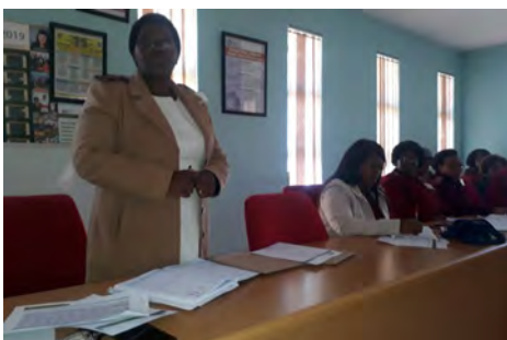
ESTABLISHMENT OF MNCWH FORUM. READ MORE ON PAGE 02