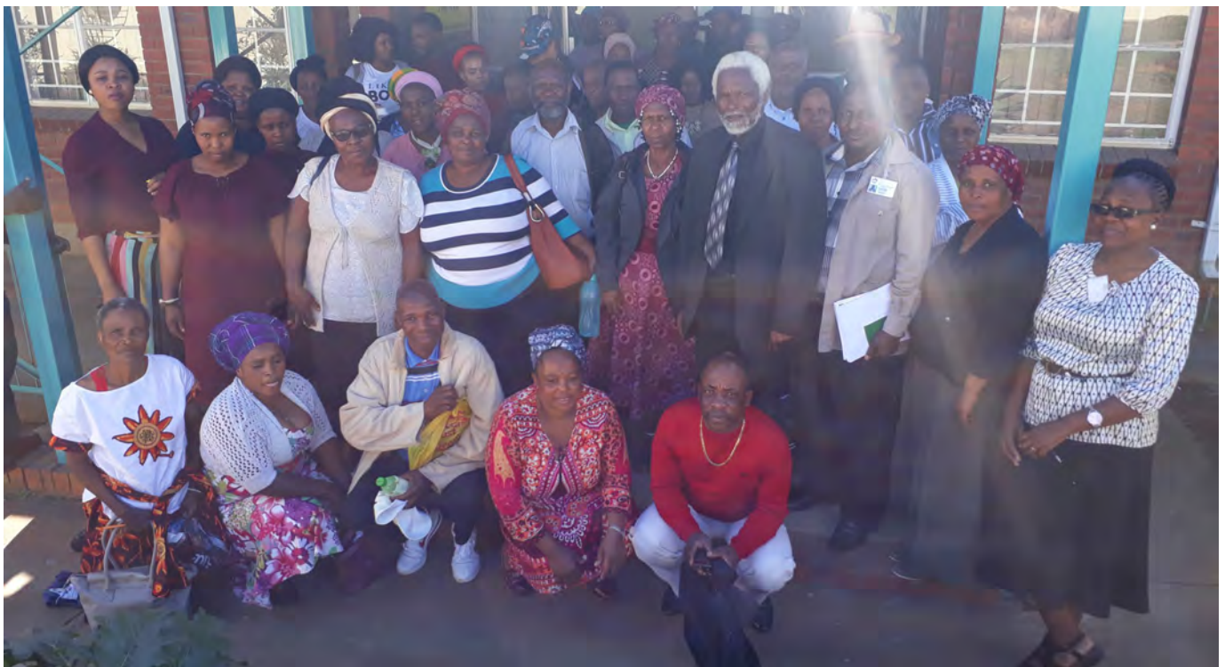
Clinic Governance Structures after finishing their five days training on Strengthen of Health Governance Structures.