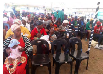
MHLUNGWANA CLINIC OPEN DAY... READ MORE ON PAGE 05.