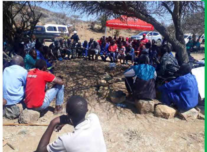
Ngwebini Community in Ward 04 who have attended the ECD Awareness Campaign.

Without building new ECD Centre they also contribute to the provision of nutritious meals for the children in the Early Childhood Development sites especially in the Province of KwaZulu-Natal in Umsinga and Nquthu Local Municipality and Gauteng Province in Tshwane Metro. They also involved in improving skills and competencies of the practitioners and investing in infrastructure upgrading of ECD sites