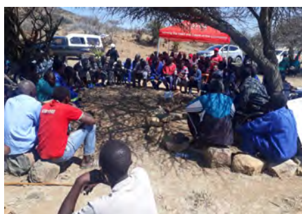
ECD AWARENESS CAMPAIGN... READ MORE ON PAGE 04