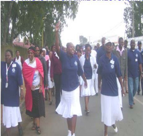
WELLNESS EVENT STARTED BY THE WALK