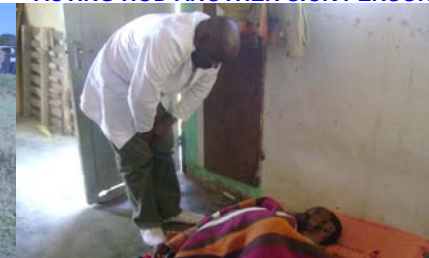
THE DOCTOR ASKING PATIENT HISTORY