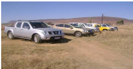
ACTING HOD CREW VISITING SICK PEOPLE