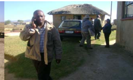
ACTING HOD ANOTHER SICK PERSON