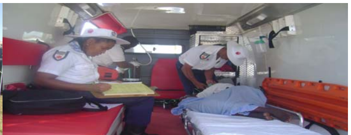
EMRS OFFERING EMMEGENCY TREATMENT