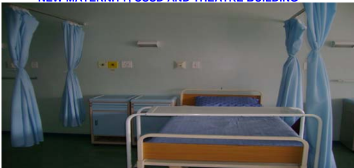
ALL WARDS ARE PROVIDED WITH CURTAINS, NEW SIDE LOCKERS AND SOME WITH NEW LINEN