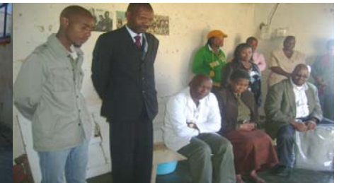
ACTING HOD OBSERVING THE PATIENT