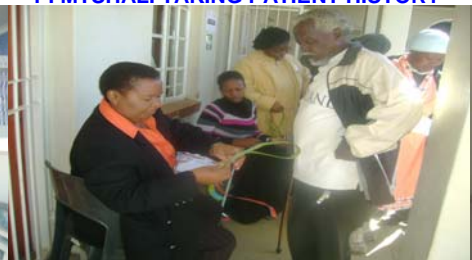
STA-CDC ATTENDING TO THE PATIENT