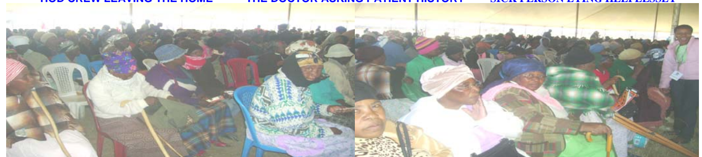
HUNDREDS OF LOCAL COMMUNITY ATTENDING THE KHANYA AFRICA IN PARTNERSHIP WITH THE DEPT OF HEALTH EVENT