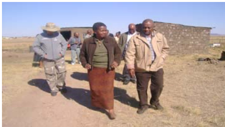
ACTING HOD CREW LEAVING THE HOME