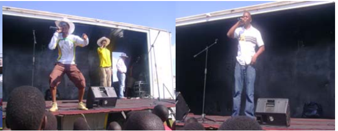
LOCAL ARTIST ENTERTAINING THE COMMUNITY