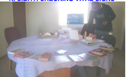
LAY COUNSELLOR PREPARING

People around Nondweni area came in numbers to attend Diabetes Screening Event.