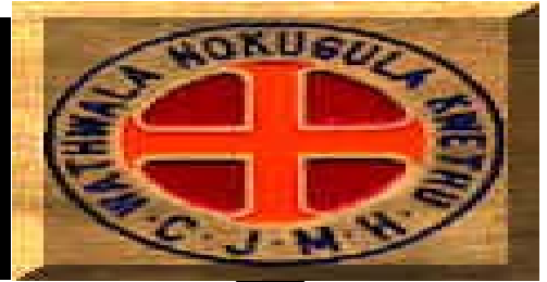
Charles Johnson Memorial Hospital

We are on the: http://Kznhealthweb.gov.za