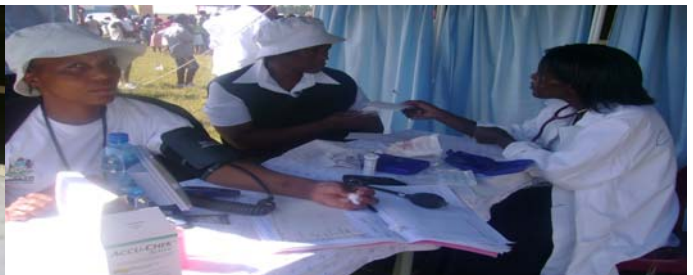
ANOTHER CJM SHETER OFFERING TREATMENT

This stupendous Event was held at Kwa-Vulamehlo area in Nqutu.