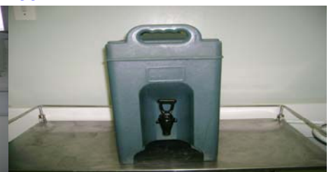
PATIENTS CARLIFLE FOR HOT TEA