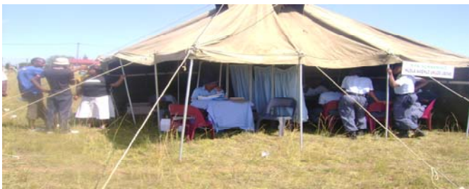
CJM EYE SCREENING SHELTER