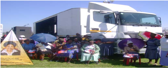
STAFF TRAILER USED AS A PODIUM