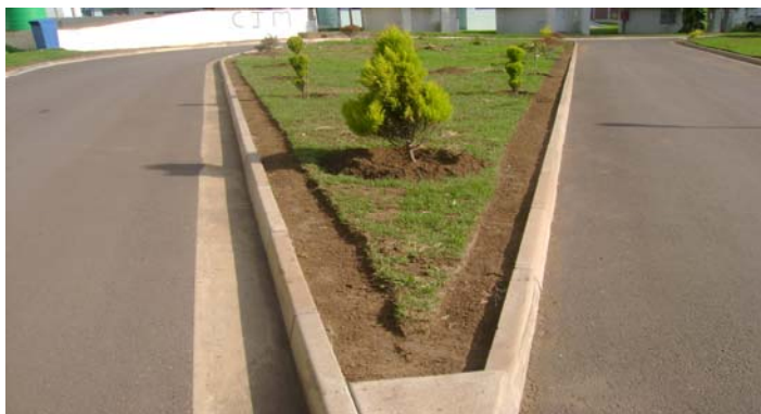
CJM GROUNDS ARE IMMACULATLY DONE