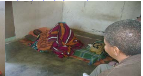
SICK PERSON LYING HELPLESSLY