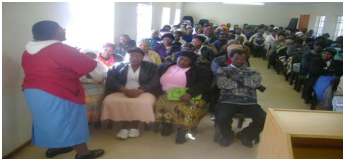
COMMUNITY LISTENING TO HEALTH EDUCATION