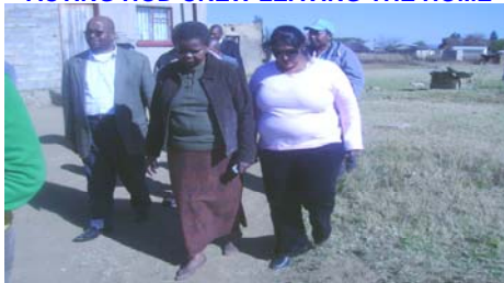
HOD CREW LEAVING THE HOME