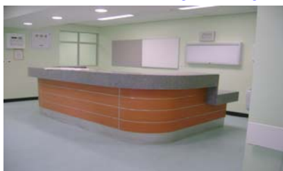
STAFF WORK STATION