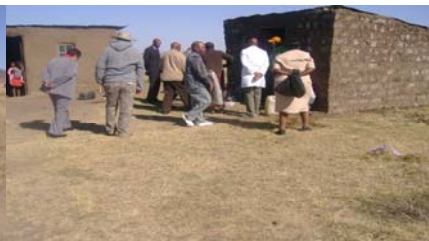
ARRIVING IN ONE OF THE HOMES