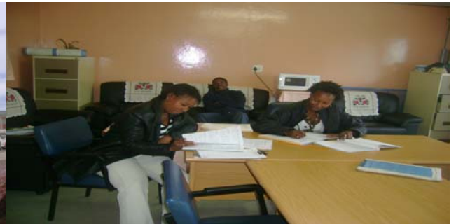
STAFF REST ROOM