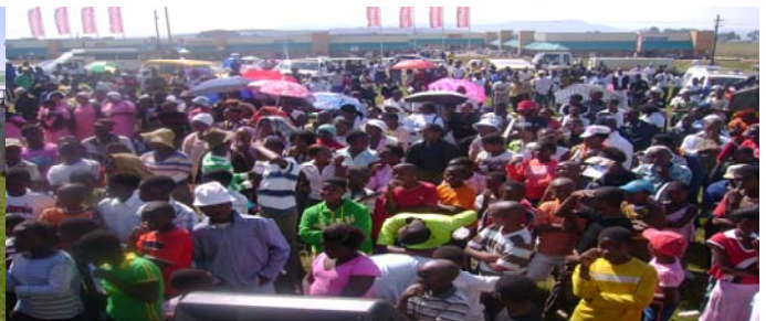
LOCAL COMMUNITY ATTENDING TB ROAD SHOW EVENT