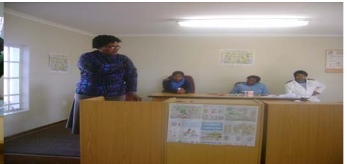
STA-HEALTH PROMOTION GIVING HEALTH EDUCATION