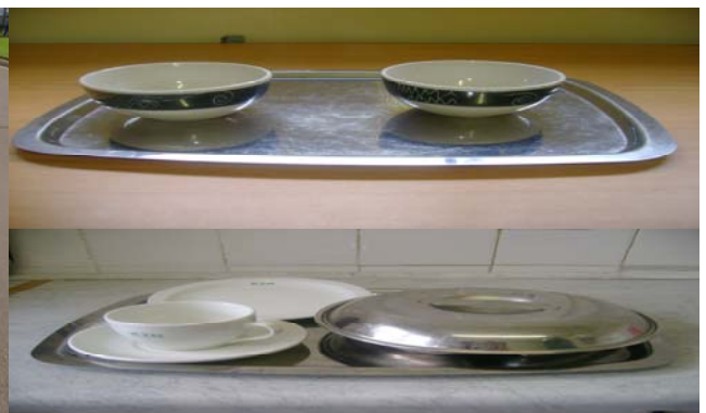
IN PATIENTS SERVED WITH DIGNITY