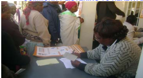
CHF TAKING HISTORY OF THE PATIENT