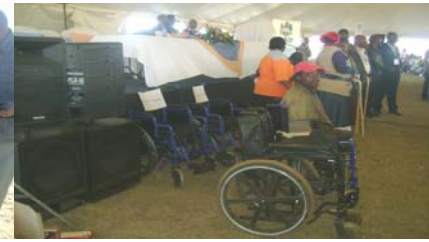
OFFERING OF WHEEL CHAIRS