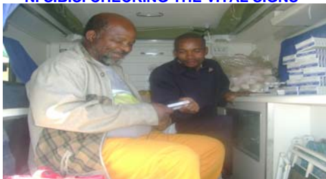
CJM MOBILE- ATTENDING THE PATIENT