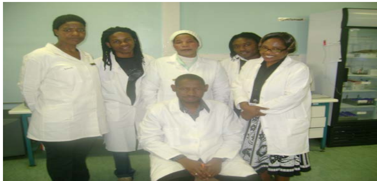
LABORATORY MANAGER ( sitting) AND STAFF “Pathology ,the only true pathway to medical understanding ”

I joined CJM Hospital in 2006, before that I was a pharmacy manager at Tyler Bequest Hospital. I have learned and gained a lot of experience from CJM Hospital. The Pharmacy Department had so many challenges, but with the support from management the Pharmacy Department have been able to pull through.