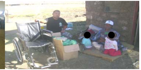
WHEEL CHAIR & FOOD OFFERED