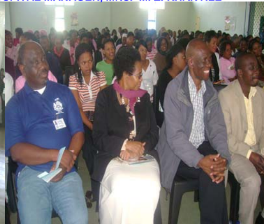
STAFF ATTENDING THE WELLNESS EVENT