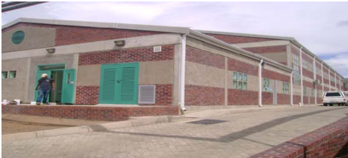
NEW MATERNITY, CSSD AND THEATRE BUILDING

patients the optimal service that we can afford. The following is just a glimpse of the improvement that we have attained at CJM Hospital. Enjoy!!!