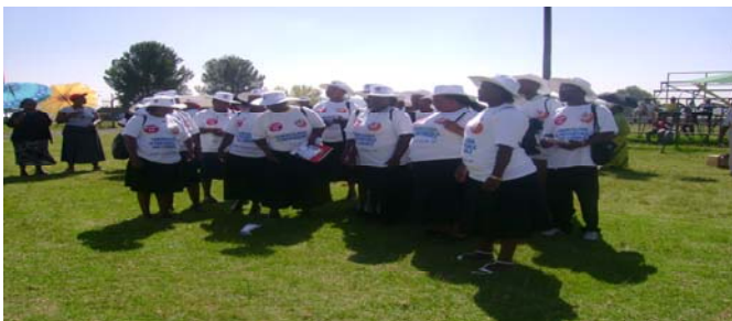
CJM HOSPITAL TB TEAM