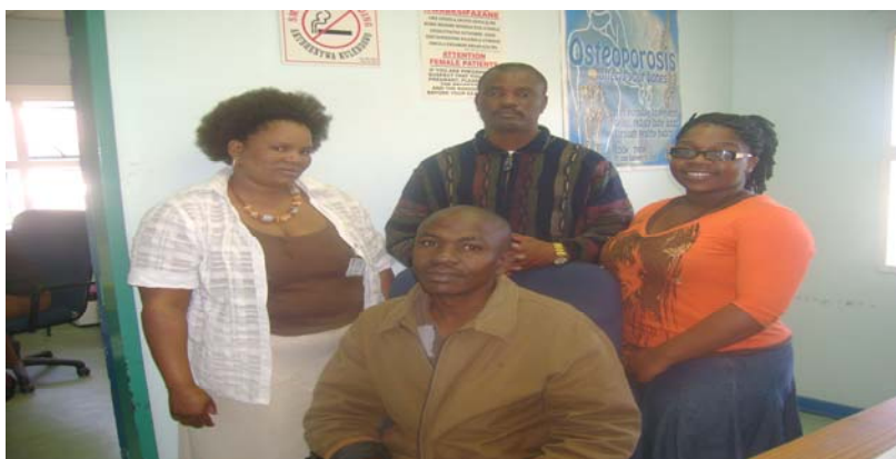
CHIEF RADIOGRAPHER (sitting) AND STAFF