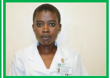
Shezi PP Enrolled Nurse Intern