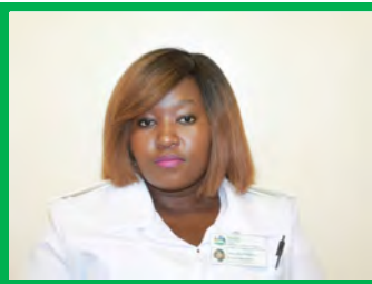
Mchunu TP Enrolled Nurse Intern