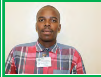
Dumakude M Finance Intern