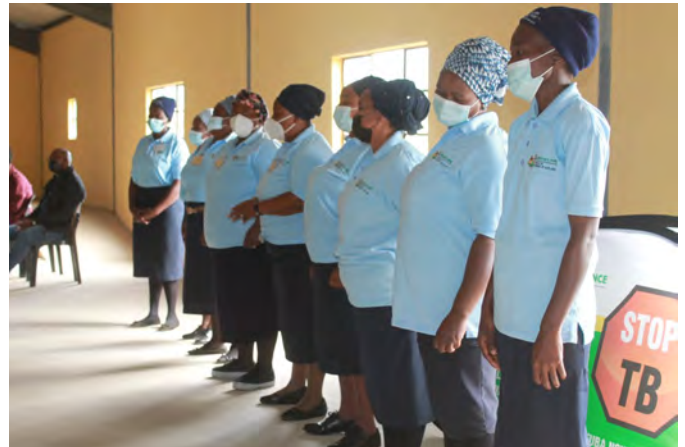
CHW's entertaining the audience