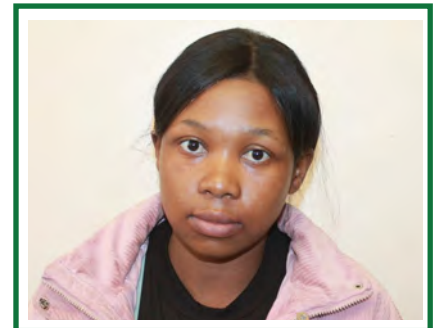
Ndawonde N. Finance Inserve