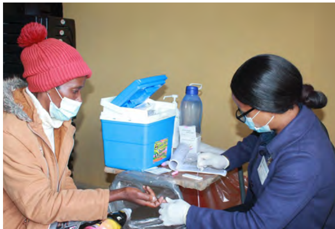
HTS Services were rendered