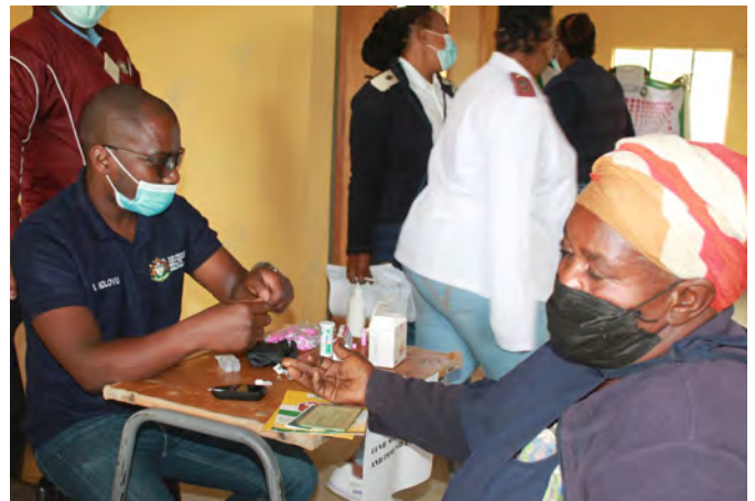
Health Services were rendered during the event.