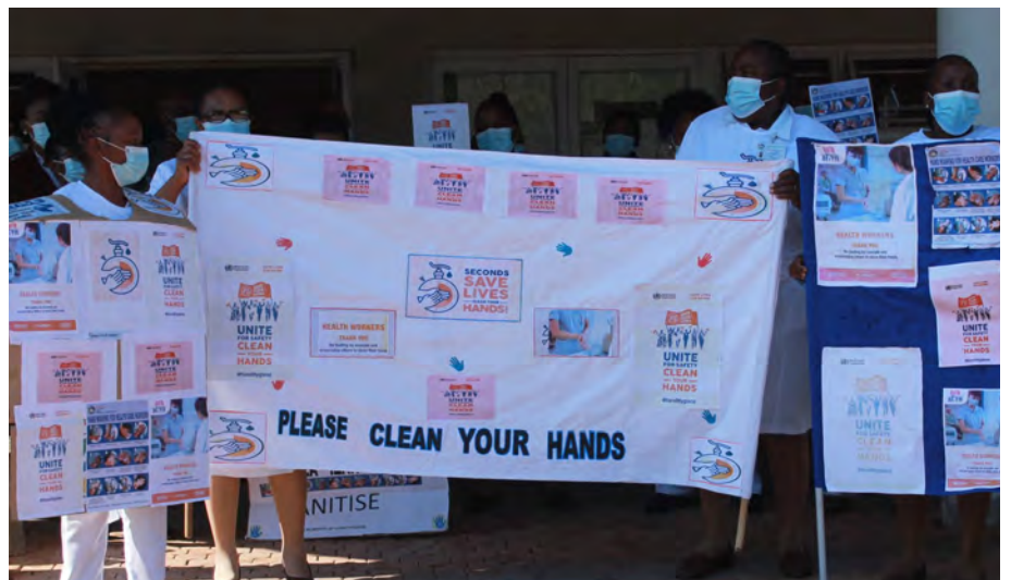
COSH Team after event.