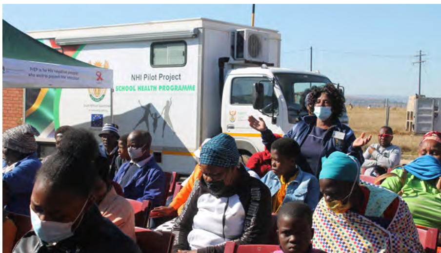
Gxobanyawo Community listening attentively to the speeches that were delivered on the day.

An open day basically is an event whereby an institution gives brief information on how it operates and to also give an insight on the services which available in that particular institution. Amongst operational hours of the clinic Collessie Clinic ensures that is opens in time and closes with the last person who is inside the clinic even if it's past closing time. Services that are rendered at Collessie Clinic are: Minor ailments, Family Planning,