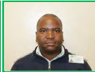
Mchunu LP Enrolled Nurse