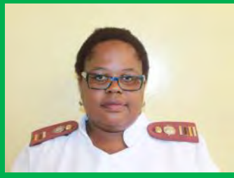
Motloun BW Clinical Nurse Practitioner