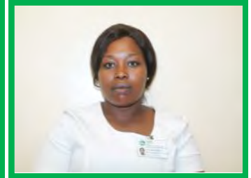
Vilakazi SI P/Nurse Comm Serve