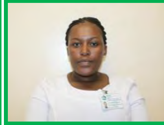
Ziqubu N.C P/Nurse Comm Serve