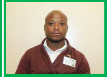
Zondi NW P/Nurse Comm Serve