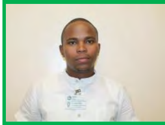
Ntuli SW Pharmacist Comm Serve