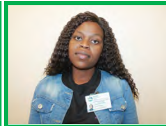
Chonco S Ground Breaker