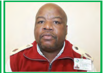
Luvuno MP Enrolled Nurse