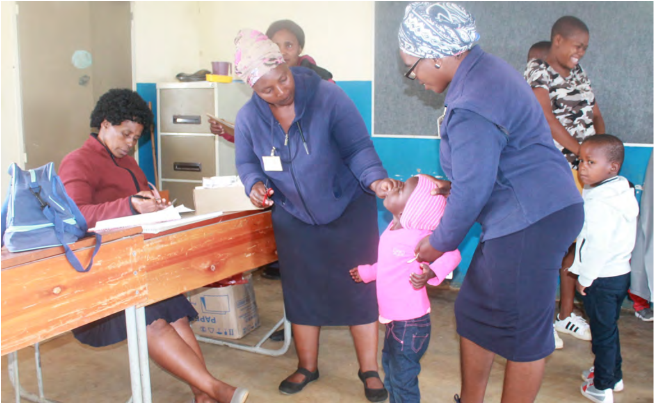
Collessie Clinic Community Care Givers (CCGs) giving the children Vitamin A.

On the 21st of March 2019 which is a National Human Rights Day, Collessie Clinic outreach team ensured that the rights of the citizens were respected and commemorated through hosting and awareness campaign at Mpophoma Primary School situated at Mabaso Area in Msinga Top. The aim purpose of this awareness was to bring the health services closer to the community and also raise awareness of the services at the offered at the clinic.