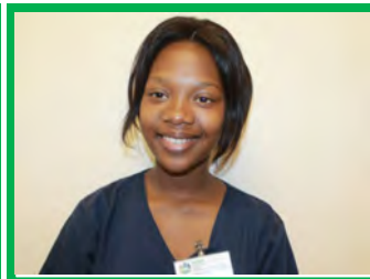
Nxumalo M Physio Therapy Comm Serve