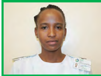
Dumakude TN Enrolled Nurse