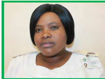
Zuma N Enrolled Nurse