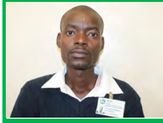
Ngobe T General Orderly