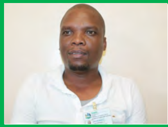
Xaba B General Orderly