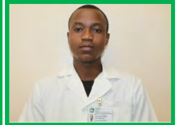
Dlomo ZS Pharmacist Intern