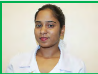
Perurnal I P/Nurse Comm Serve