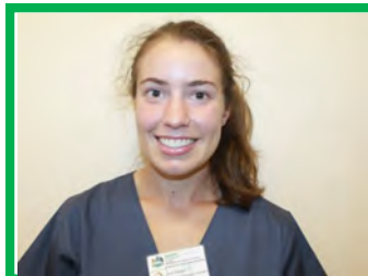
Krugel Z OT Comm Serve