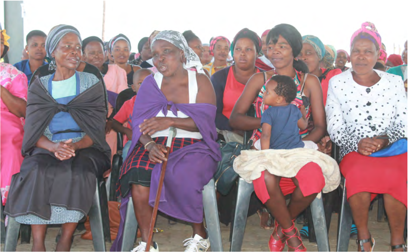
Mbangweni Community Members at the Open Day Event .