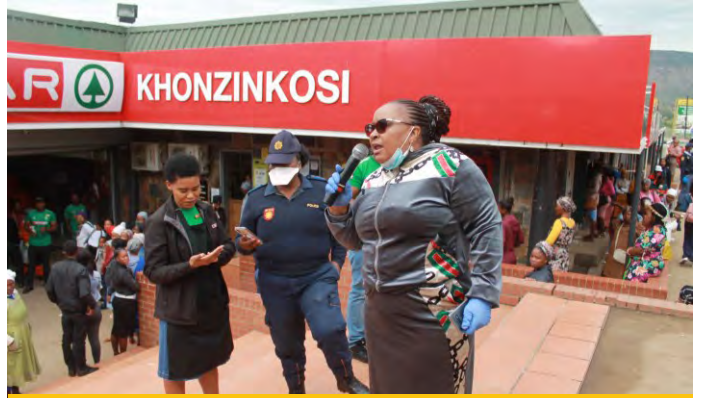
Honorable AS Zuma during management of queues