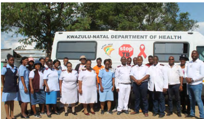
Health Team who participated in Qo Qo Qo campaign at Msinga Top Area