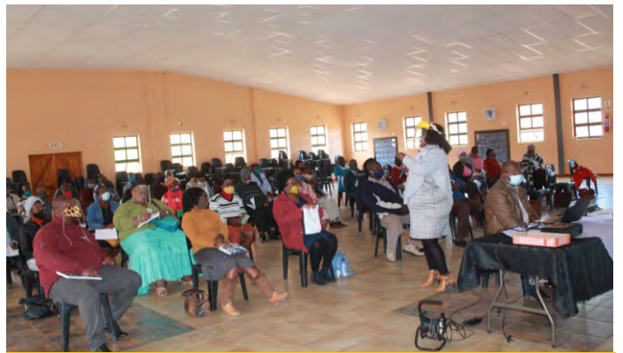
PHC Trainer Mrs BN Mvelase during COVID-19 training of Principal of schools in Msinga