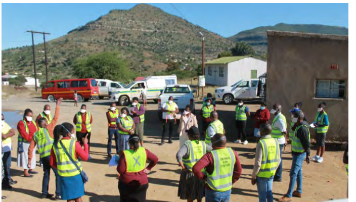
Outreach Teams as they plan how to execute their duties