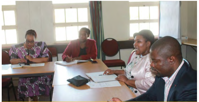
Principal from different portfolios at JOC meeting