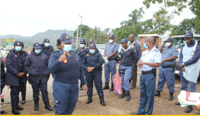
Msinga SAPS parade prior to outreach activities