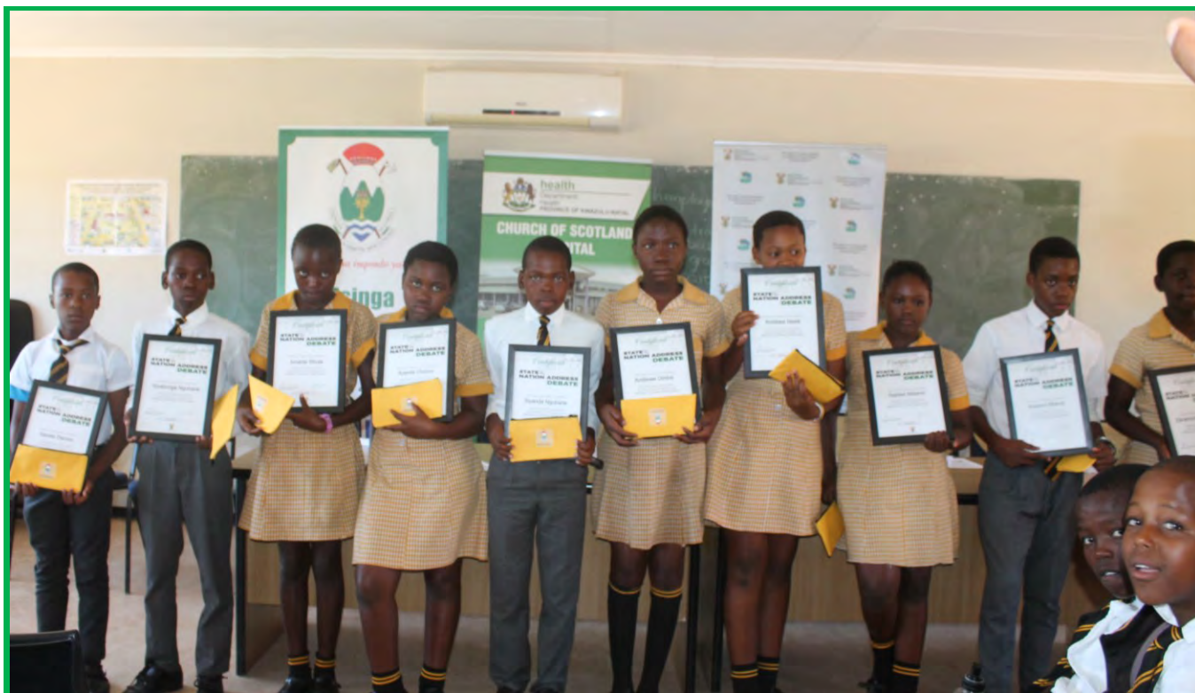
The above picture: Sibumba Public Primary School pupils showing with their certificate of participating in the SoNA debate

On the 13th of February 2020 Pre-SoNA, GCIS in collaboration with other government department partaken on hosting the SoNA debate following the 7 Priorities announced by the President on the SoNA of 2019. The main purpose of this debate was to educate at primary level on how government functions and to also capacitate pupils with their participation skills and also involvement on their views and rights in shaping the future of the Republic of South Africa.