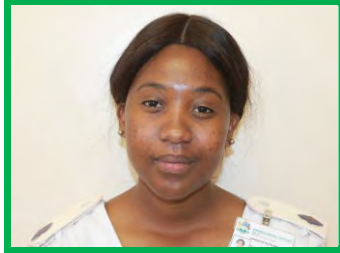
NP Thamando Enrolled Nurse