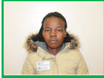
B Nsele HR Inserve