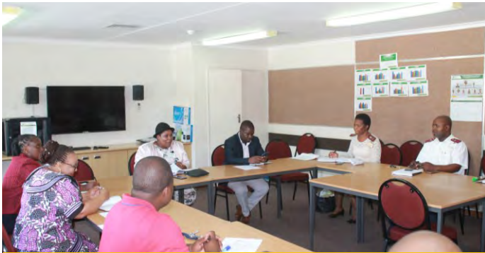
Principal from different portfolios at JOC meeting