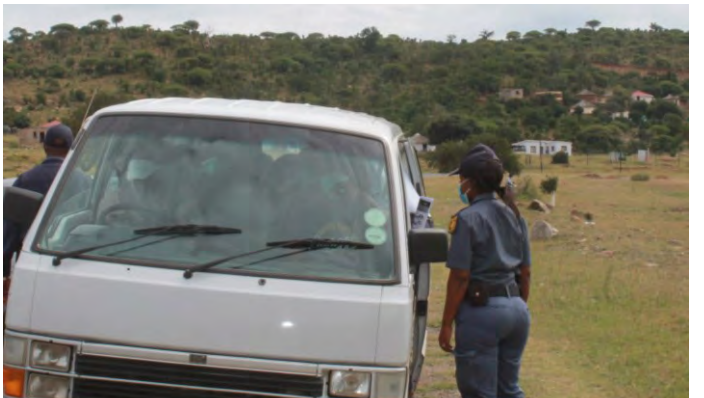
SAPS Ensuring that regulations are follows