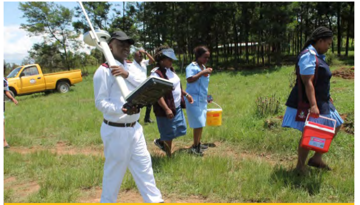
Msinga Health Team tracking on foot from household to household