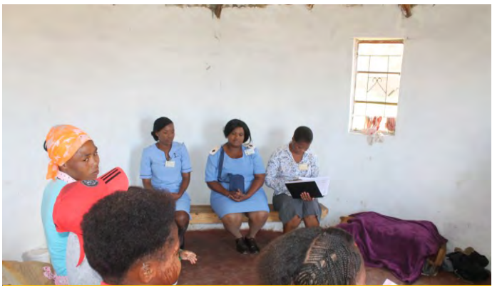
Engaging with Females on all health related issues in which women face