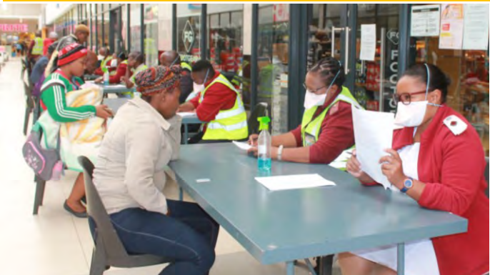
Screening desks at Tugela Ferry Mall during the National Lockdown