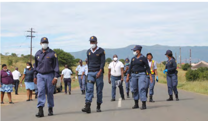
SAPS & DoH at Roadblocks