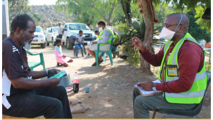
Nurse Mchunu interacting with Induna during the screening process at the home stead of Induna