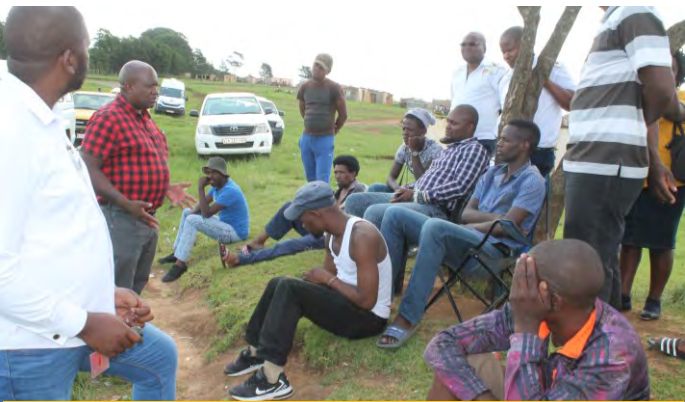
Engaging with Men on all health related issues in which men face