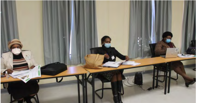
COSH CEO, Deputy Director and Acting District Director in the meeting