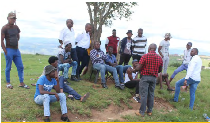
Engaging with Men on all health related issues in which men face