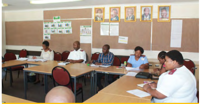
Principal from different portfolios at JOC meeting