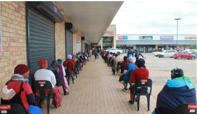
Queue management at Post Office Tugela Ferry Mall