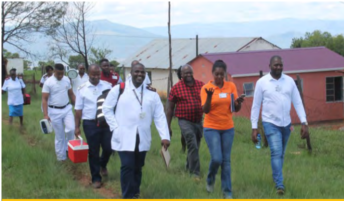
Msinga Health Team tracking on foot from household to household