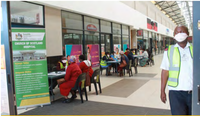
Tugela Ferry Mall screening and testing setup for organized process of shopping