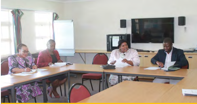
Principal from different portfolios at JOC meeting