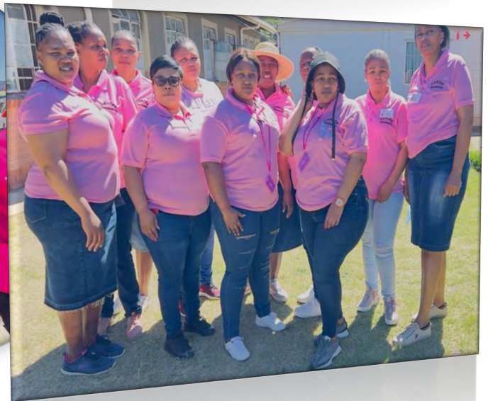
CANCER AWARENESS DAY