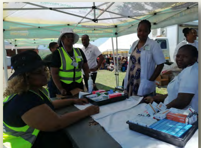
Above: Pharmacy department patiently waiting to dispense much needed medication.