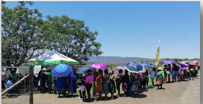
Above: Patients lined up to register before being directed to relevant stations.