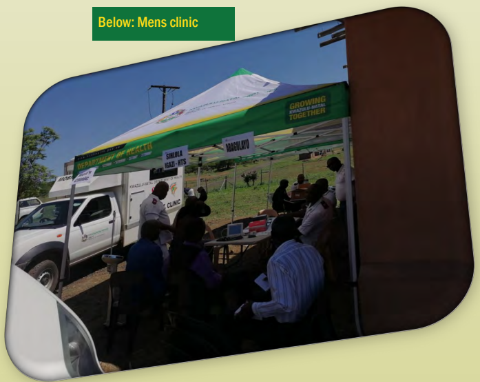
Below: Mens clinic