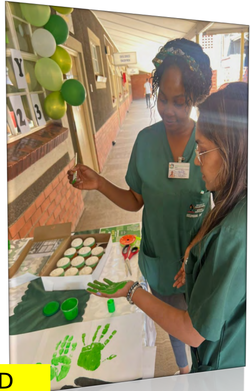
FUN ACTIVITIES DURING THE WORLD OCCUPATIONAL HEALTH DAY