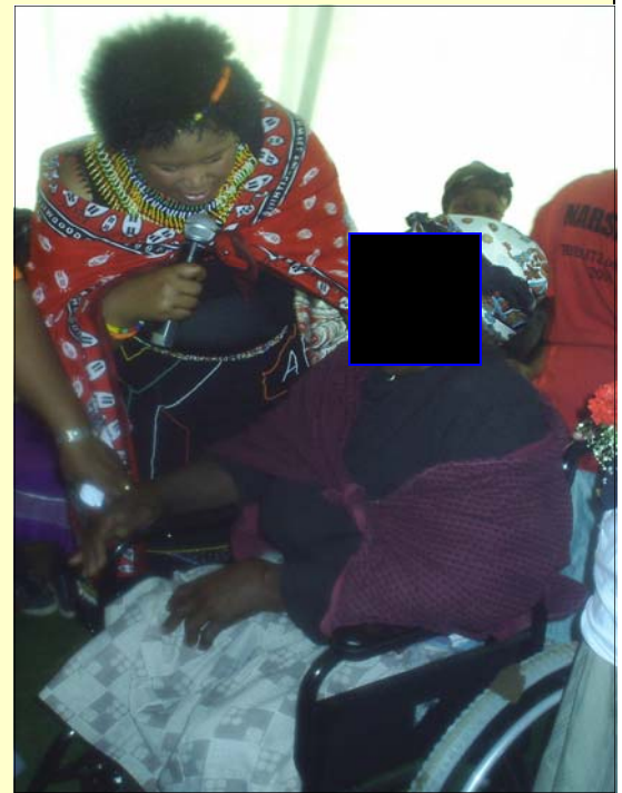
She also handed wheelchairs to disabled patients

For more information on TB Call Nonhlanhla Msomi on 044 493 0004 ext 3039 Uzozizakala!!!!!!!!!!!!