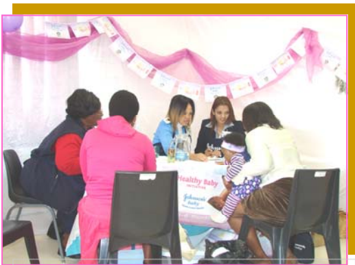
Above: mother answering health questionnaire about her baby whilst judges were scoring her.

The qualifying criteria was an up to date road-health-chart; timeous attendance of clinic appointments and successful answering of health related questions posed to mothers. There were three categories; 0 - 06 months; 07 - 13 months and 13 - 18 months. The Judges comprised of health workers working in the Umzinyathi Health District in surrounding health facilities. Winners were awarded with prizes courtesy of Johnson's Baby Company.