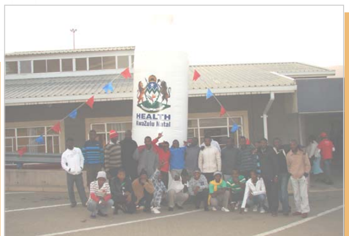
Above: a group of young men celebrating the successes of the MMC procedures done to them by the medical professionals in a photo across.