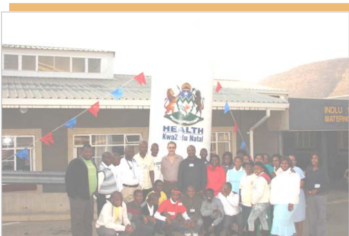
Above: A team of medical professionals who volunteered for the MMC camp.

The procedures started at 09h10 and were finished at 13h20 with no post operation complication such as severe pain, swelling or bleeding reported by the initiates. They were observed overnight for any of the latter and were discharged the next morning. It only took 3 hours and 10 minutes for the seven doctors to com-