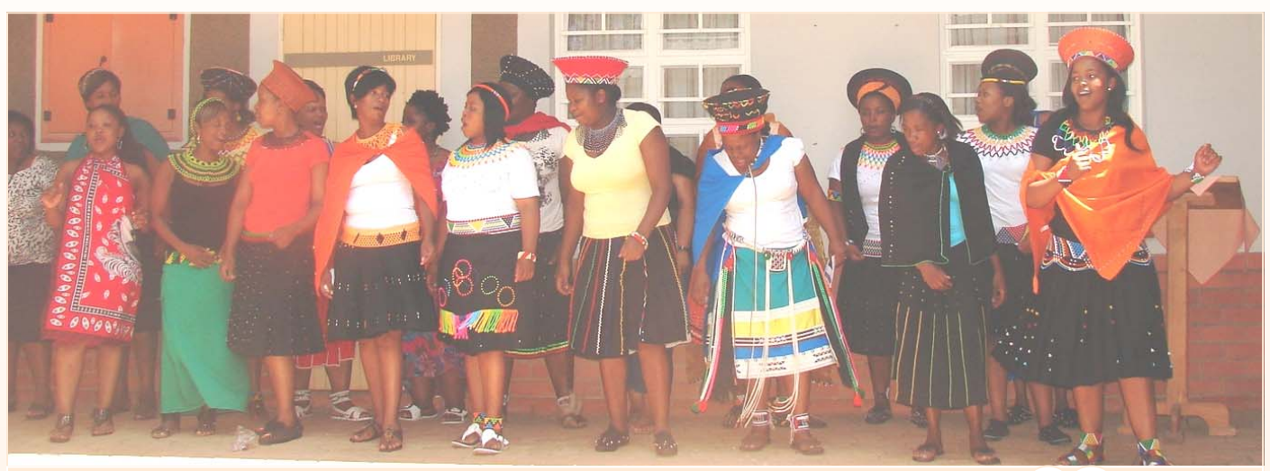
TRADITIONAL ATTIRE SHOWCASED