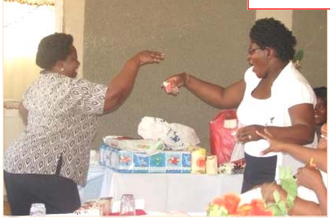
...and it was party time!!!