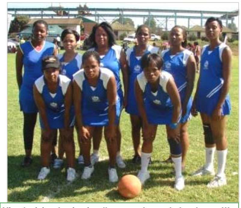
Yizo lezizintokazi esigadla ngazo kuzwele kwabanye!!!

In a tough draw with neighbouring hospitals, our netball team made it a walk in a park leaving other teams in tears and despair. Really 2010 had been a good year for our sports.