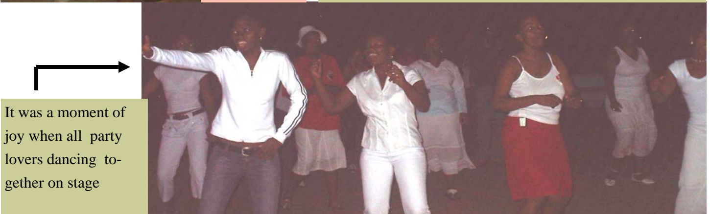
It was a moment of joy when all party lovers dancing together on stage