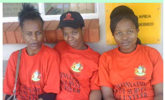
Students from CJM were allocated next to X Ray, Dental and Therapy department

Visit our website www.kznhealth.gov.za/coshospital.htm