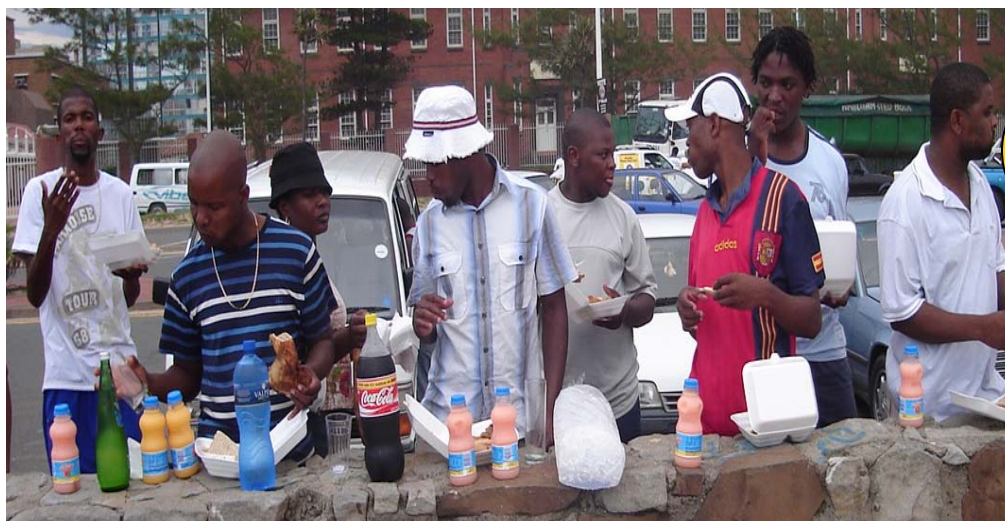
Team members having lunch after games.