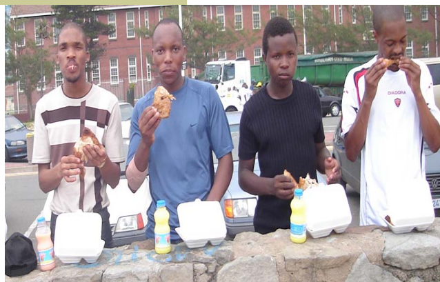
It looks like these guys were scared to eat in front of the camera!!!!