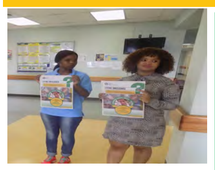
PHARMACY MONTH... READ MORE ON PAGE 3-4