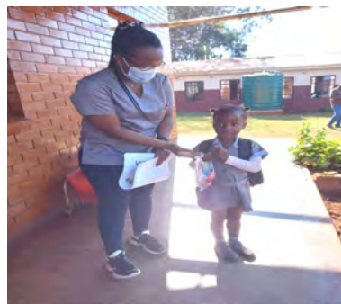
NUTRITION WEEK... PAGE 3-6