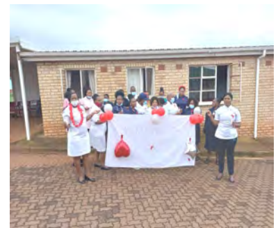
WORLD AIDS DAY...PAGE 10