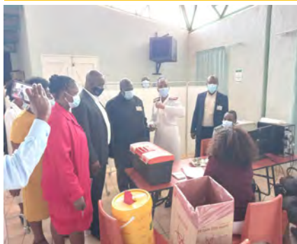
LEGISLATURE VISIT...PAGE 2