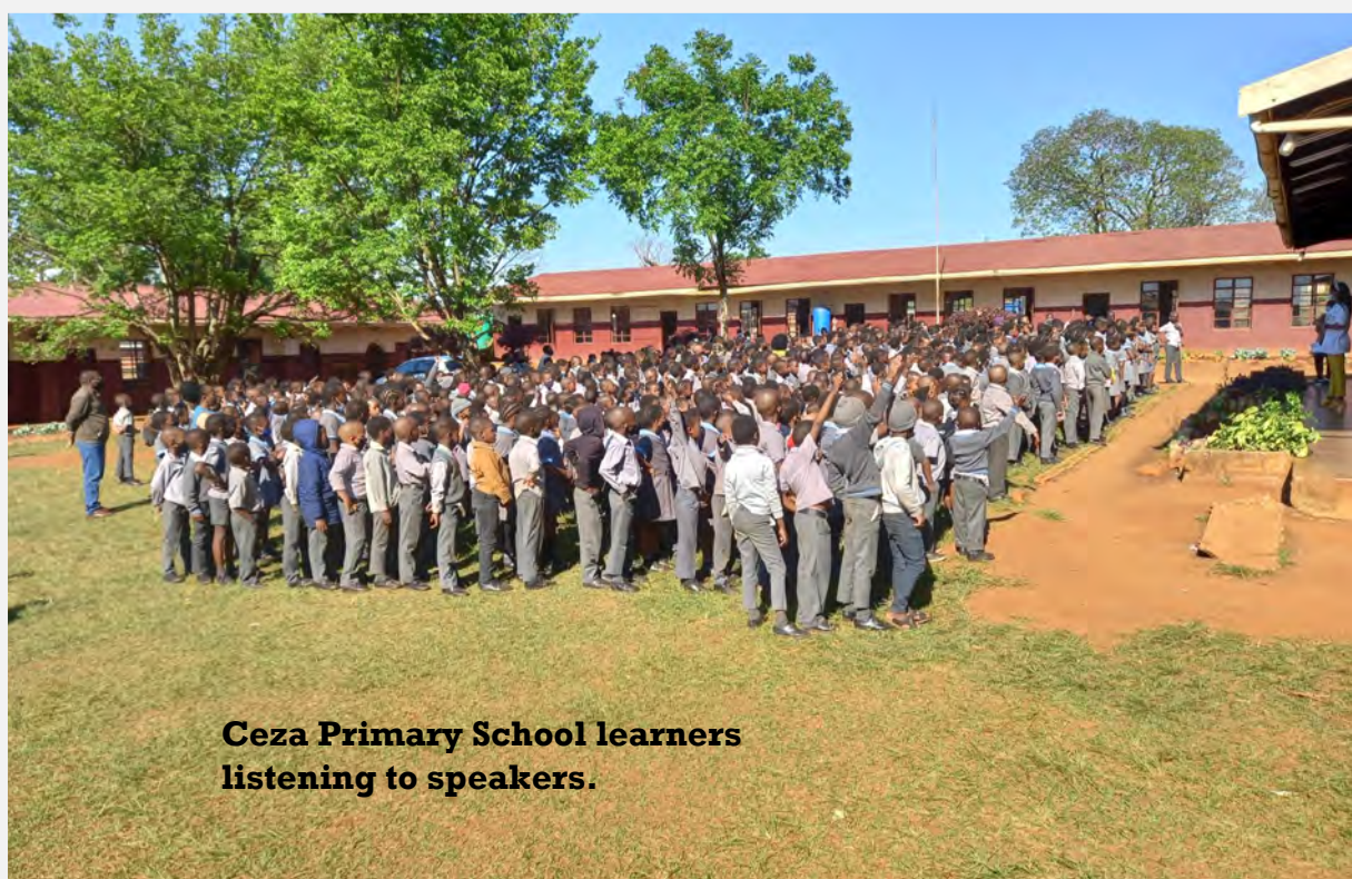
Ceza Primary School learners listening to speakers.