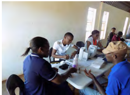
WORLD TB DAY...PAGE 5