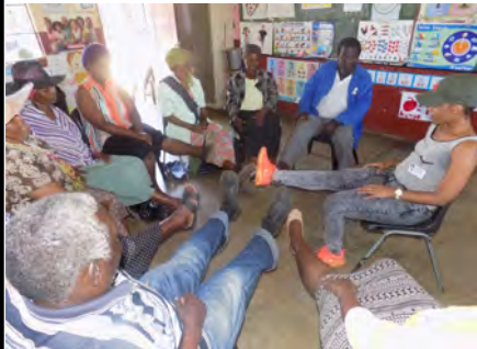
OPERATION MBO... READ MORE ON PAGE 2-5