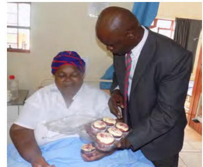
VALENTINE'S DAY...PAGE 6