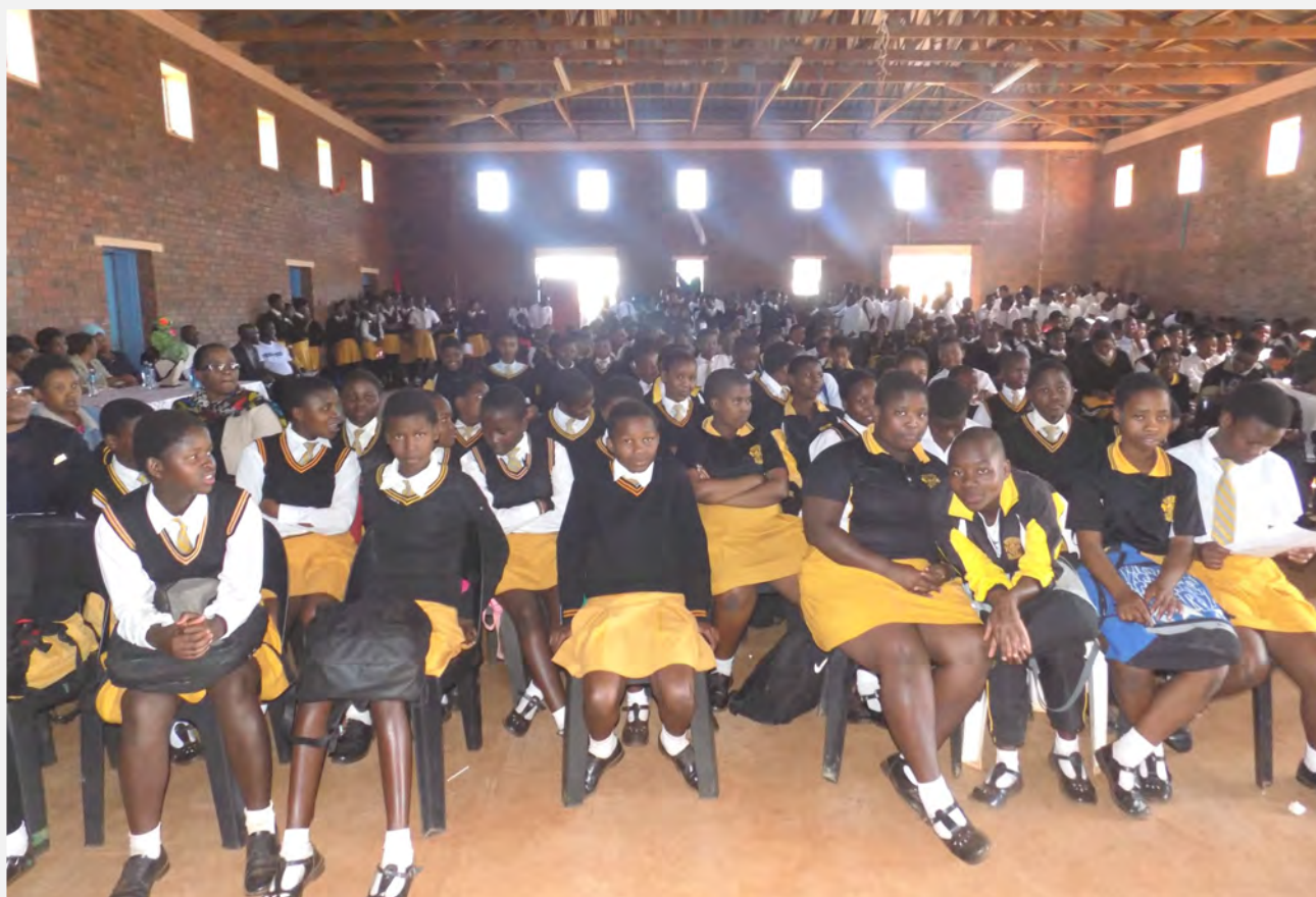
LEARNERS FROM MNYAMANA MEMORIAL HIGH SCHOOL