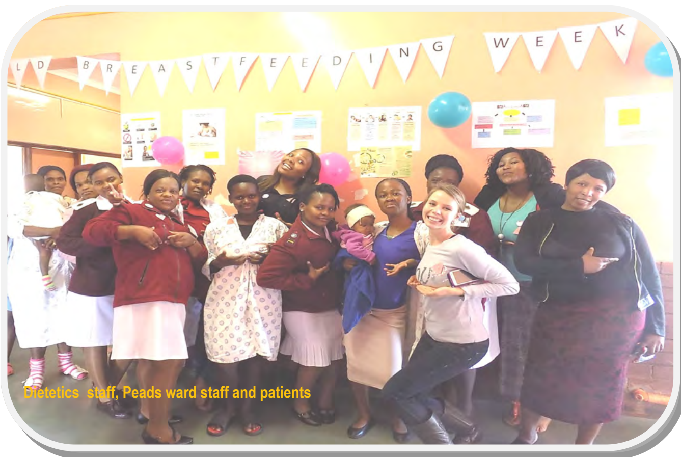
Dietetics staff, Paeds ward staff and patients

C eza hospital joins the world in celebrating breastfeeding week. The theme for 2016 breastfeeding week was "a key to sustainable development". All PHC facilities under Ceza hospital were visited by the Dietetics component to educate community about the importance of breastfeeding. Maternity and Paediatric wards were also visited. Health education on breastfeeding was given to all patients in OPD. Clinical and non clinical staff were also trained on exclusive breastfeeding. Pamphlets with breastfeeding information were distributed to patients. Dietetics component also visited supermarkets around Ulundi to train their staff on breastfeeding.