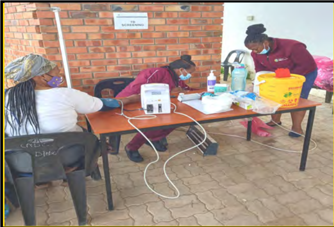
Vital signs station.