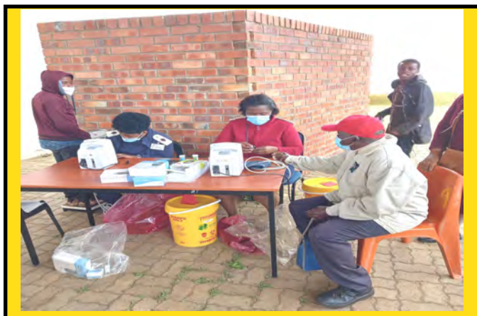
Vital signs station at IDlebe area.