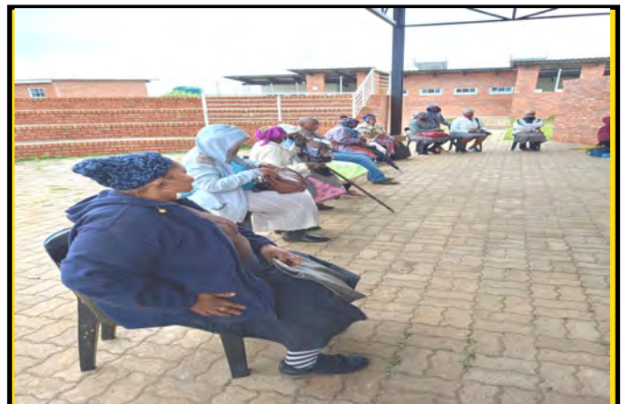
Patients waiting for services.