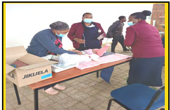
Nutrition corner at IDlebe area.